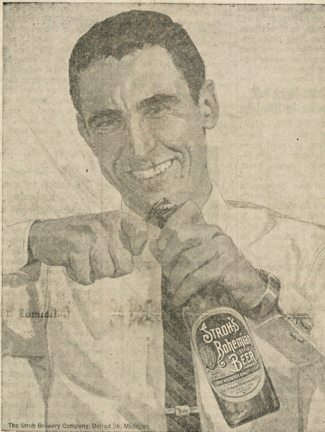
The Stroh Brewery Company, Detroit 26, Michigan

Odprite prijatelju eno steklenico z ognjem - varjenega piva