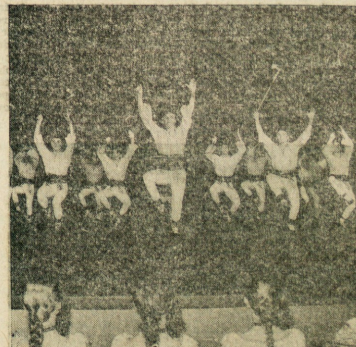
Fiery Male Dance Czechoslovakia State Folkdance Troupe (With Harlem Globetrotters)

Monday, December 28th at 8:00 p.m. at the Arena, a huge program will be presented with the Czechoslovakia State Folk Dance Troupe of 40 members performing before the start of the basketball game of the Harlem Globetrotters and the Washington, D.C. Generals. They will also perform at half-time intermission.