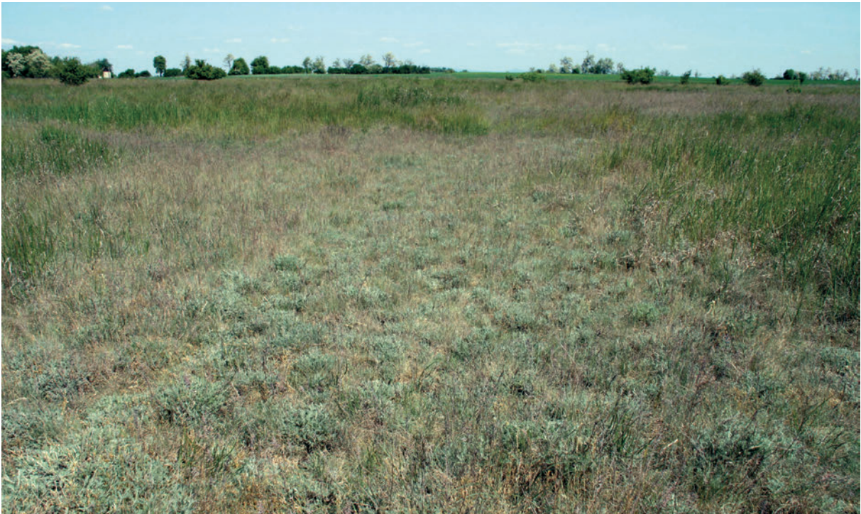
Figure 2: Relatively large stand of Artemisia santonicum subsp. patens surrounded by vegetation of Molinio-Arrhenatheretea in Malé Čiky site.

Slika 2: Relativno velik sestoj vrste Artemisia santonicum subsp. patens , ki ga obkroža vegetacija razreda Molinio-Arrhenatheretea na lokaliteti Malé Čiky.