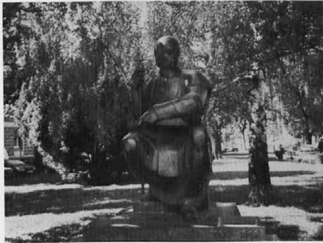
Slomšek, a Slovenian hero