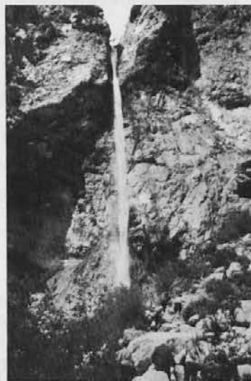
Climbing to see the waterfall Rinka

Maribor smo zapustili z najboljšimi vtisi. Popoldne smo se odpeljali do Rogaške Slatine, kjer je poznana trgovina z veliko izbiro lepega kristala in to po malo znižanih cenah. Potem pa kar nazaj proti Bledu. Vozimo se skozi Tuhinjsko dolino, Močnik, Zg. Tuhinj, Stara Sela, Kostanj, Šmartno, Vrhpolje, Kamnik itd. vse do Bleda. – Nadaljevanje –