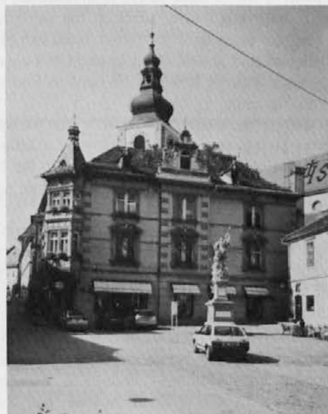
Ptuj, the oldest town in Slovenia