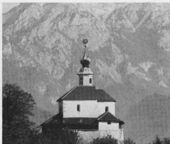
Mali grad - Kamnik

Obiskali mesto Ptuj z gradom. Mesto ima 12000 prebivalcev. Najprvo smo si ogledali vinsko klet, bili deležni okusnega prigrizka ob poskušanju petih različnih vrst vina. Nato pa smo se odpeljali preko reke Krke na Ptujski grad, kateri je najboljše ohranjen v Sloveniji. Zgrajen je bil v 12. stoletju. Najstarejši del gradu je še ohranjen. Leta 1697 je bila gradnja gradu ojačena in obnovljena. V gradu smo si