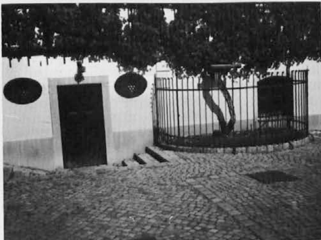
The 400 year-old grape vine in Maribor

of the most delightful evening meals and entertainments awaited us.