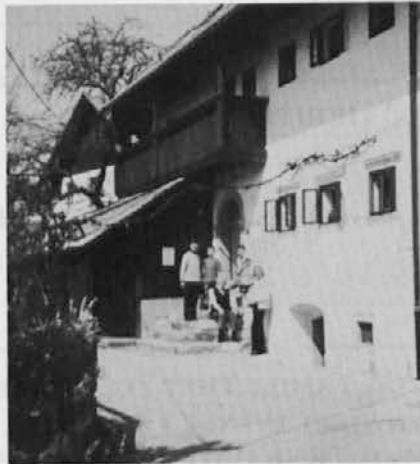
Pri Bernikovi hiši v Skofji loki