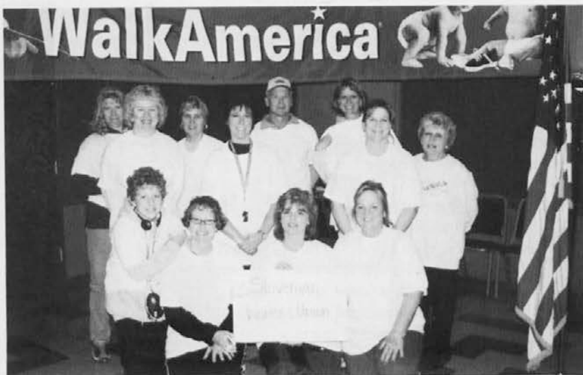
WALK AMERICA – MARCH OF DIMES was held on May 2nd. Participants from Br. 20 are pictured here.