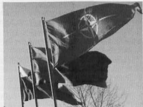
SLOVENIAN, NATO and EU flags fly together at Ljubljana center