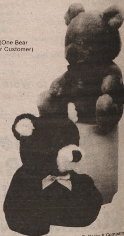
(One Bear per Customer)