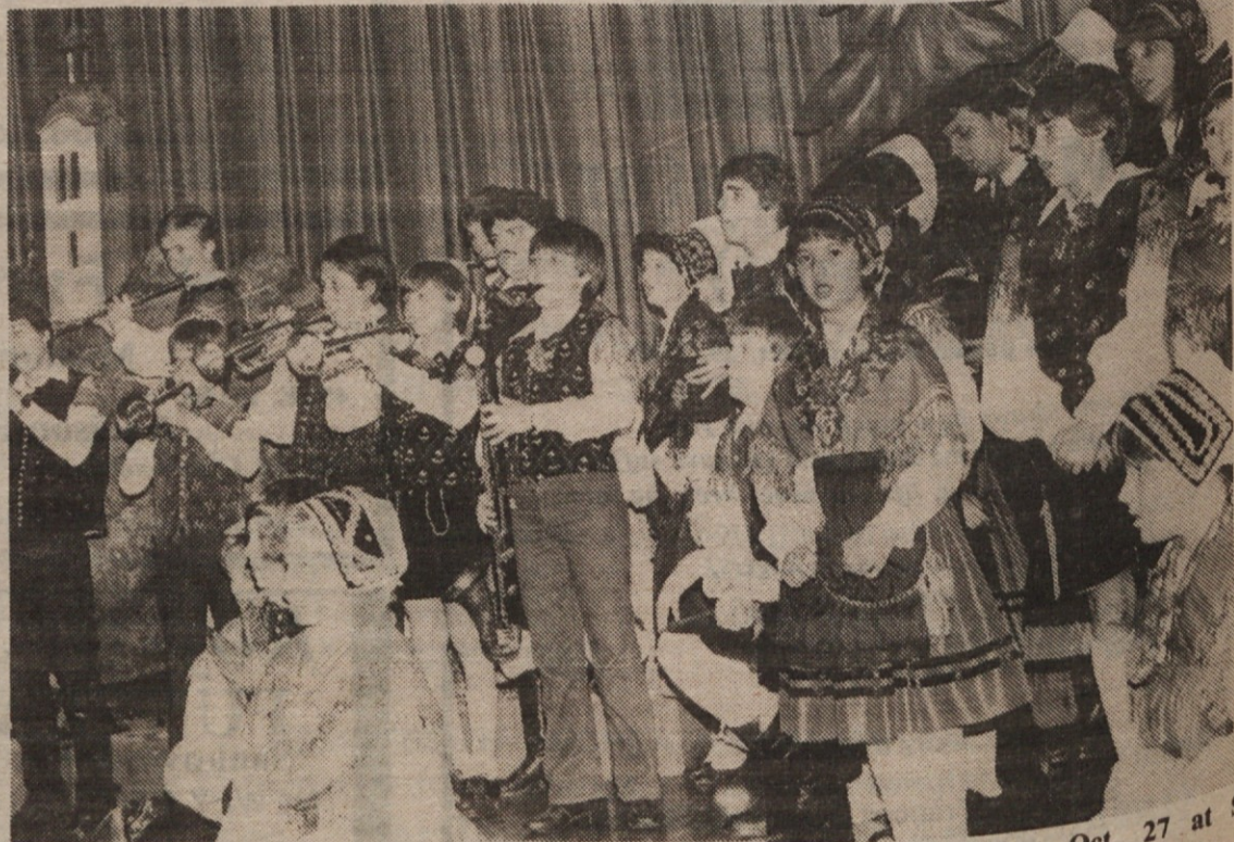
The Mladinski Orkester and Slovenian American Radio Club Folkloric Dancers perform at their annual show on Saturday, Oct. 27 at St. Stephen's Hall. (More pictures next week.)

St. Mary Magdalene Lodge No. 162 KSKJ adult and youth Christmas party at St. Vitus Social Room at 2 p.m.