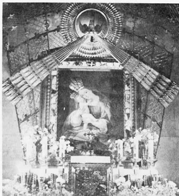
Stranski oltar Marije Pomagaj na Brezjah v Sloveniji