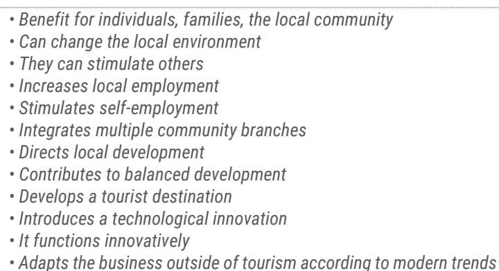
Figure 2: Influence of Small Business on Local Environment

From the general role of a small business in the local environment, we derived the concrete and specific role of the small business in tourism on the development of the local community, according to Figure 2.