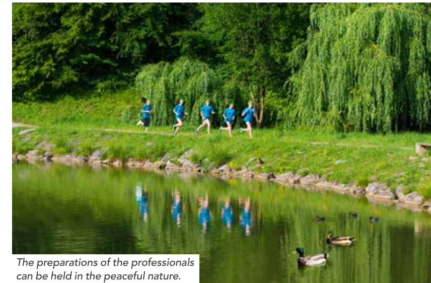
The preparations of the professionals can be held in the peaceful nature.

Slovenia has a number of specialised sports centres, and most of what is on offer for world-class athletes is connected to the well-developed tourist destinations, such as Slovenian natural health resorts. This is also why athletes will be welcomed warmly anywhere they go, and there will be a lot of flexibility regarding their accommodation, food, and other major factors