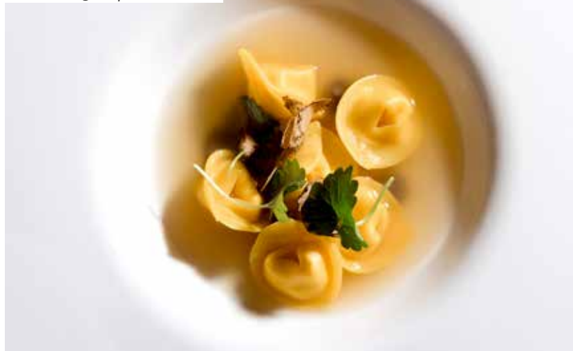
Ana Roš A refreshing soup with tortellini

emphasis on nutrition. Dishes based on local tradition, which were rich in calories and protein content, were prepared for the participants. "Every athlete could eat corn polenta with skuta curd cheese, which contains a lot of good protein, just like whey, of which it is made, and is a very fitting food for consumption following sports activities. A nice plate of pasta or žlikrofi dumplings, a Slovenian speciality, are also suitable. I would also recommend the frika omelette made of potatoes, cheese, and herbs, but it is a somewhat heavier dish. Lighter dishes include soups, such as jota, which is a very energising and healthy dish due to the content of sauerkraut or turnip, which contain a lot of vitamin C."