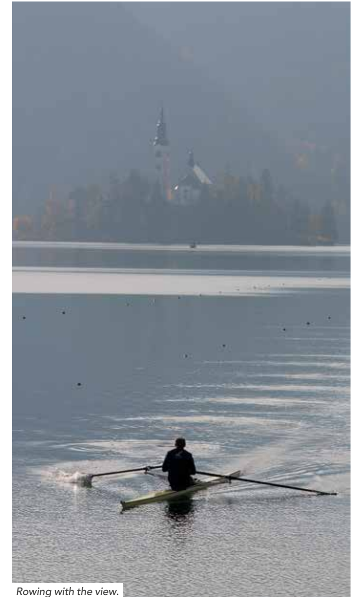
Rowing with the view.

The best Slovenian indoor sports venues and stadiums that host international sporting events are also available for matches between various teams that know just why they carry out their preparations in Slovenia, their choice amongst all other