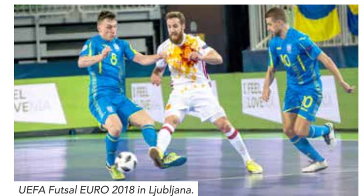
UEFA Futsal EURO 2018 in Ljubljana.

Between 30 January and 10 February, Slovenia hosted the UEFA Futsal EURO 2018 ( futsaleuro2018.si ), futsal championships, which is played by as many as 30 million futsal players around the world and is one of the fastest growing sports in the world.