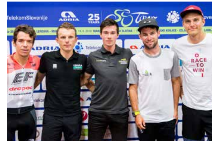
Rigoberto Uran, Rafał Majka, Primož Roglič, Mark Cavendish, Marcel Kittel