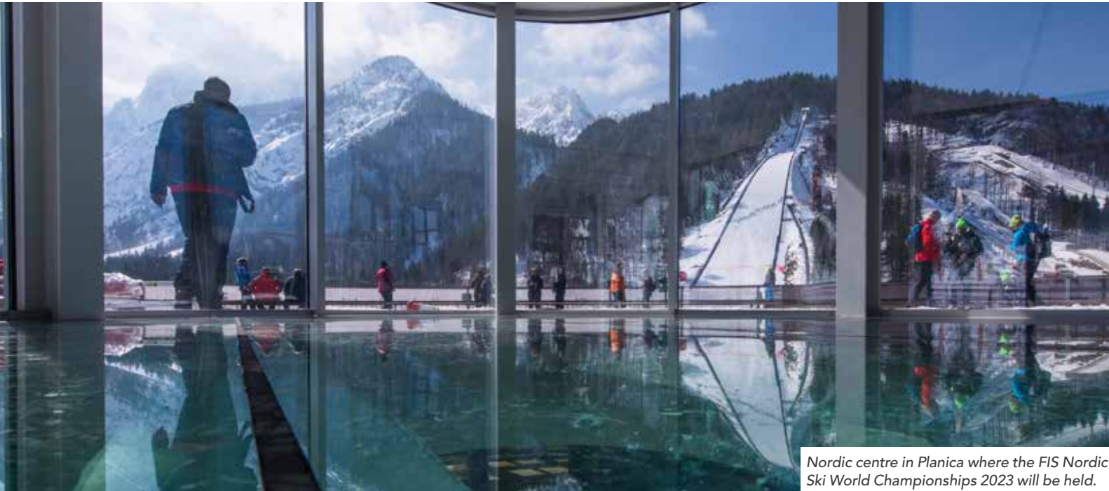
Nordic centre in Planica where the FIS Nordic Ski World Championships 2023 will be held.