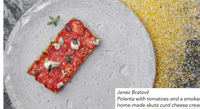
Janez Bratovž Polenta with tomatoes and a smoked home-made skuta curd cheese cream