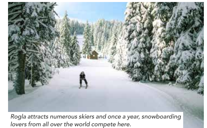
Rogla attracts numerous skiers and once a year, snowboarding lovers from all over the world compete here.

At the other end of the country, in Rogla, in January the FIS Snowboard World Cup ( www.rogla.eu ) attracts the attention of snowboarding fans all over the world.