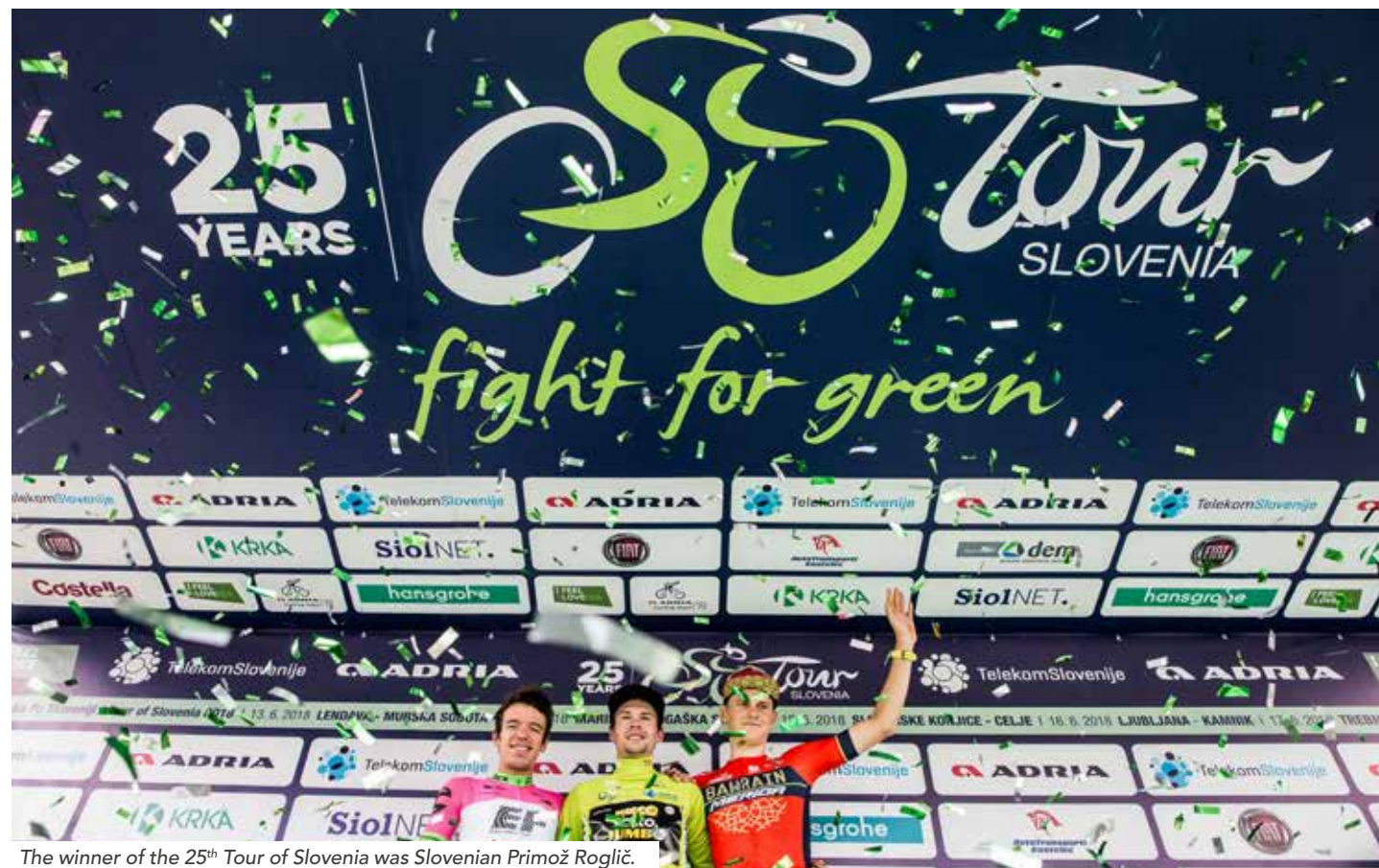
The winner of the 25 th Tour of Slovenia was Slovenian Primož Roglič.