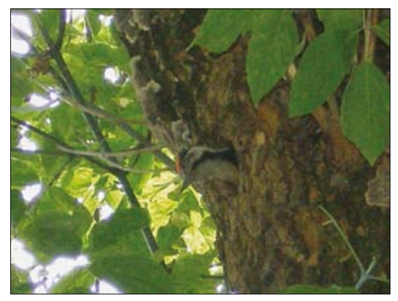
Figure 3: Location of the nest of Syrian Woodpecker Dendrocopos syriacus in Duke Stepanović Boulevard (above) and the nest's opening with young in the Box Elder Acer negundo (below); Banjaluka, Bosnia & Herzegovina, 3 Jun 2008

Slika 3: Lokacija gnezda sirijskega detla Dendrocopos syriacus na Bulevaru vojvode Stepe Stepanovića (zgoraj) in odprtina gnezda z mladičem v amerikanskem javorju Acer negundo (spodaj); Banjaluka, Bosna in Hercegovina, 3.6.2008