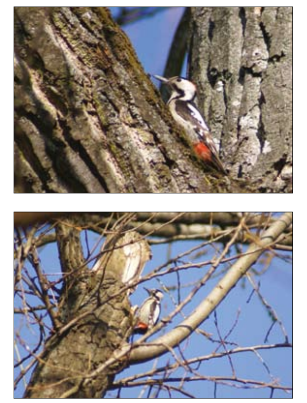
Figure 2: Male (above) and female (below) Syrian Woodpecker Dendrocopos syriacus ; Banjaluka, Bosnia and Herzegovina, 29 Feb 2008

Slika 2: Samec (zgoraj) in samica (spodaj) sirijskega detla Dendrocopos syriacus; Banjaluka, Bosna in Hercegovina, 29.2.2008