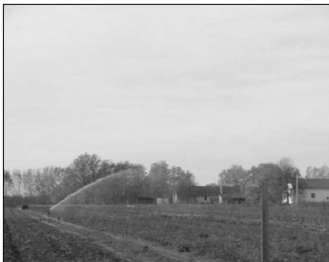
Fig. 4: A farm doing agricultural activity, Szatymaz.