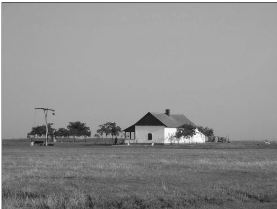
Fig.1: A scattered farm in the Great Hungarian Plain.

Scattered farms are most often seen as successors of the “outskirts gardens” having gone through a change of function. Outskirts gardens were land areas in private use and appeared as early as in the 16 th and 17 th century. They originally served the purposes of animal husbandry: they were winter shelters for the livestock taken out from the common herds or flocks, they were the places where fodder was collected and stored, and manure was used to cultivate the land. In other words: animal husbandry was accompanied by the cultivation of the land. If the cultivation of the land and stable-based, indoor animal husbandry became more important in the farming structure of these dwellings, i.e. when a more permanent settlement took place, a scattered farm was born (Beluszky 1999, 100). The first scattered farms thus were economic units established in the outskirts gardens, dividing the vast pastures of the “puszta”, the waste land (Frisnyák 1990, 86). The majority of the scattered farms was later established independent of the outskirts gardens, when it became necessary or possible to create “farming centres” on the outskirts (e.g. after the formerly common lands became private holdings).