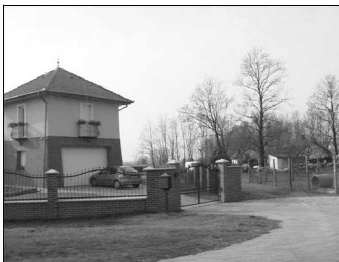
Fig. 5: A suburban residential farm on the outskirts of Kecskemét.