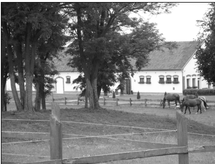
Fig. 9: Equestrian tourism in Mórchelypuszta, a part of Nagykanizsa.