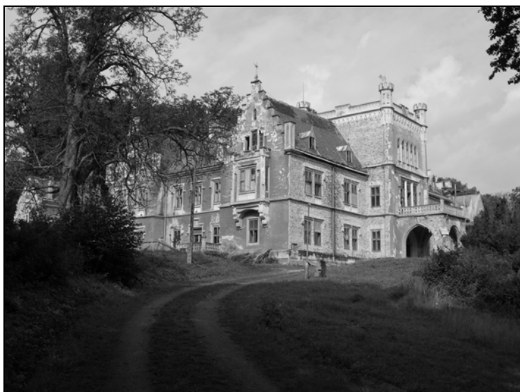
Fig. 7: A manor house in bad condition on the outskirts of Mikosszéplak.

Although manors – similarly to scattered farms – are usually located on the outskirts of towns and villages, there are 9 allodiums in West Transdanubia that have become sovereign settlements by now. All of them are in the category with a substantial number of inhabitants. On the other hand, a significant proportion of the outskirts with original manor buildings are often inhabited by disadvantaged, impoverished social layers.