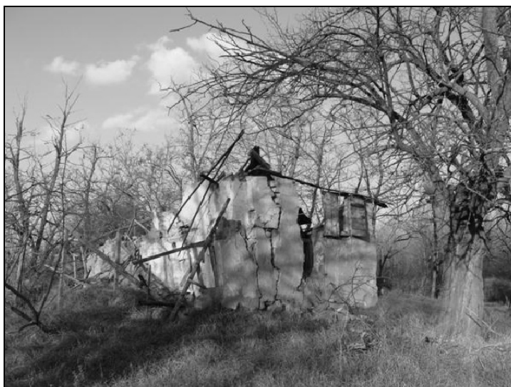
Fig. 3: A decaying scattered farm, Kiskunmajsa.