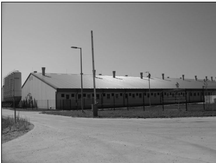
Fig. 8: Modern pig farm on the outskirts of Pusztacsó.

that are used but it happens in some cases, especially for keeping horses. In five manors – one in Győr-Moson-Sopron and four in Zala county – touristic activity can be a function on its own (wellness, equestrian schools, animal petting, reserve, holiday resort).