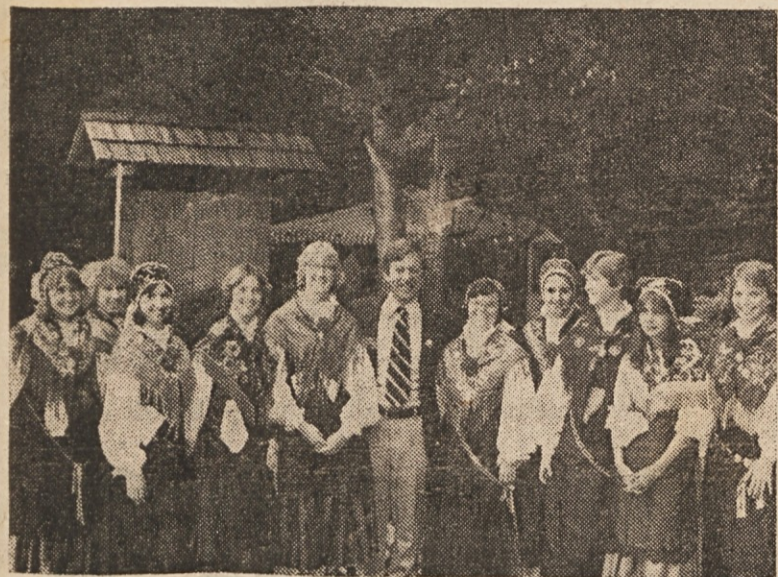
George Voinovich at Slovenska Pristava

Congratulations to our subscriber and supporter, Slovenian, George V. Voinovich who was elected last Tuesday, Mayor of Cleveland.