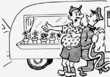
"Let's not forget the flowers, Bud."

Paper-play pastimes are a wonderful way to amuse youngsters on a long trip — and a safety measure to prevent them from distracting the driver. With "Eureka" seal books in more than 60 different styles, you can easily choose a few sets representing farm and game animals or birds you might see along your way. As each child locates one of these creatures through the car window, he pastes its picture on a sheet of paper. Or spotting license plates from different states, the child can award himself a gold star for each new state he recognizes.