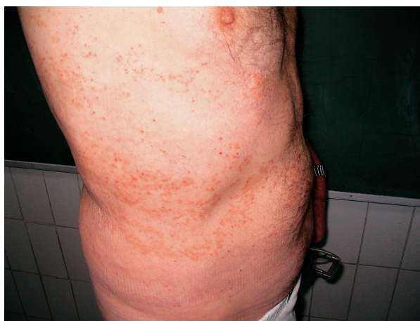
Figure 1. Multiple, crusted, keratotic, erythematous papules with a Blaschko-linear distribution on the right side of the trunk.

There are no reports of patients with localized DD transmitting generalized disease. The risk of transmis-