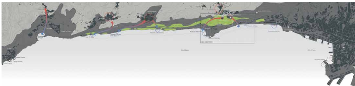
Figure 1: Terraced vineyards are associated with the villages on the edge of the Karst ridge. The area of context and the area of study are highlighted in the drawing.

The project site is located in the region of Friuli Venezia Giulia, Province of Trieste, Municipality of Trieste, locality Contovello. The province of Trieste can be represented by two neighbouring bands of variable thickness: the Karst plateau and the coastal strip. The built environment consists of the city of Trieste and a number of smaller towns of ancient formation, based on predominantly agricultural or fishery related activities, located immediately around the scattered Karst plateau and the coast