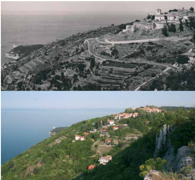
Figure 8: Comparison of a historical photo and a current photo from the lookout Trmadevec. The settlement of Contovello dominates the underlying areas with vineyards. (1952, M. Maganji). In the current image the urban sprawl is reducing the quality of the cultural landscape and a grove of cedars hides the settlement of Contovello partially.

If you compare two photographs, one from 1952 and one from 2010, transformations undergone in the area during about sixty year emerge. In particular, the loss of the definition of boundaries is noted, the disorderly building growth, the overgrowth, the loss of identity of the historical settlement of Contovello and the consequent weakening of the hierarchy between buildings and open spaces. Through the juxtaposition of two images taken near the Strada Napoleonica, the phenomenon of overgrowing is evident: the terraces which once extended to the sea are hardly visible (see Photo 6).