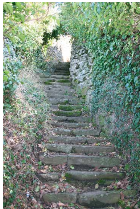
Figure 10: Long stone stairs between the dry stone walls of the terraces. Slika 10: Dolge kamnite stopnice med suhozidi teras.

The proposed intervention, following the divisions of the agricultural lots respects the subdivision of the area. The width of current paths winding within dry stone walls, is in some cases very narrow (50-80 cm) a direct consequence of the morphology but also of the original function.