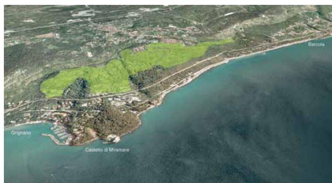
Figure 6: The vineyards on terraces located between Contovello and Miramare are visible from the sea, from some points of the coast and from panoramic viewpoints in the city of Trieste.

In the aerial photo the extension of the terraces in Contovello is shown, above the railway line. From the sea they form the backdrop to the Park of Miramare, since the plateau behind is not visible.