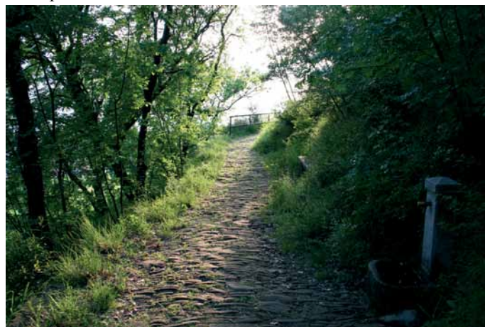
Figure 4: Authentic path paved in stone connecting the Karst ridge to the Adriatic coast.

from Trieste to Venice. The altitude is approx. 100-250 m.a.s.l. The area has developed gradually in the transition zone between the limestone formation, the band of sandstone and, towards the sea, the area of the flysch. Limestones generally have low erodibility due to its compactness, and high permeability, characteristics that lead to a landscape with rounded hills. This is the case of the Karst plateau north of Contovello. Flyschlike geological structures, however, have a medium-high degree of erodibility, caused by the intense stratification and the presence of soft and non permeable marl layers, resulting in a much more rugged landscape with steep slopes and deep grooves. The morphology of the ridge is intimately linked to the type of rock. The border of the Karst ridge is of limestone, the lower band consists of sandstone with rather sweet slopes, while from an altitude of 130-170 m.a.s.l. a layer of flysch evolves with a more pronounced inclination.