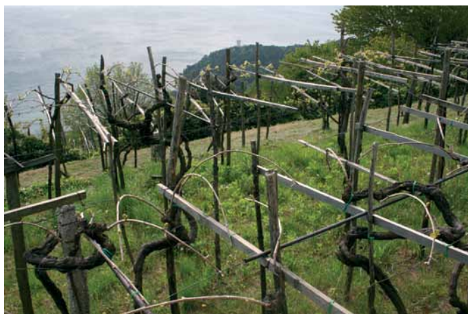
Figure 3: View of vineyards on the terraces above the Miramare Castle and Park.

The landscape is characterised by widespread and extensive terraces testifying the presence of ancient agricultural cultivation. In the study the partition walls and support of the terraces are made of dry sandstone and host crops mainly of vine. Among the terraces there is a network of access paths, also bordered by stone walls. The project proposes the recovery of these artefacts related to the landscape features of the area.