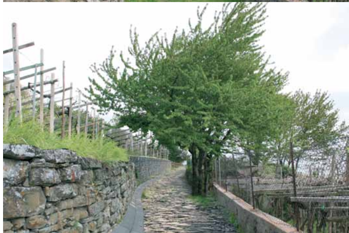
Figure 14 and 15: Comparison between the existing situation and the proposal. Simulation based on photographs showing the visual impact of the intervention. Sliki 14 in 15: Primerjava med obstoječo situacijo in predlogom. Simulacija s pomočjo fotografij prikazuje vizualni vtis posega.