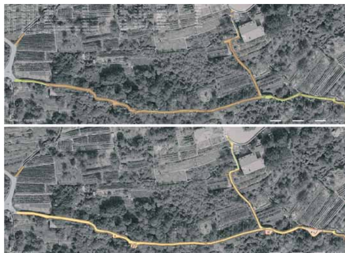
Figure 11: Comparison between the existing situation and the proposal. The visual impact of the pitches is clear.

The effects of the intervention on the surrounding landscape and on the area of intervention The evaluation of landscape compatibility concerns both the area of intervention and the surrounding landscape, both during construction and after construction. In the evaluation it is important to take into account the improvements which the realisation will bring to the entire system of terraces through the resumption of cultivation. The preservation of this cultural landscape requires active cultivation. The abandonment of cultivation and subsequent reforestation are the main causes of the process, going on for years, which is reducing the extension of the cultivated landscape of the terraces.