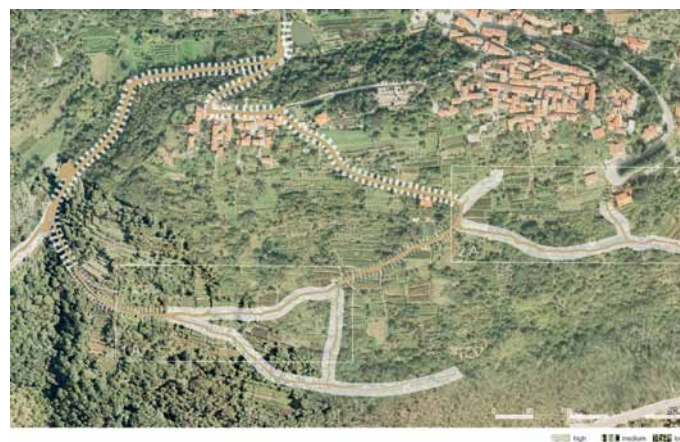
Figure 12: The authenticity of the current network of paths is high. Slika 12: Današnja mreža poti je zelo podobna prvotni.

sections where it is necessary to widen the roadway to achieve the width of 1.5 m which is considered necessary. According to an audit of the project it was noted that in phase 1 approximately 60% of existing walls are maintained, while in the area of phase 2 around 54%.