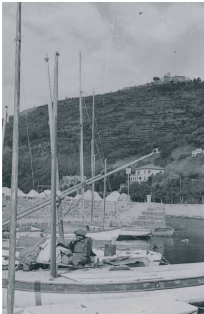
Figure 7: Terraces of Contovello seen from the port of Cedas. (around 1950, M. Magan).

The area is part of the context of the Karst designated as a site of the ecological network "Natura 2000" under the Habitats and the Birds Directive.