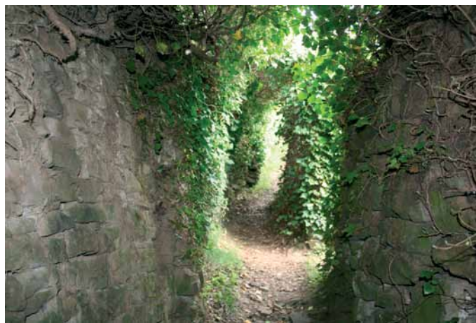
Figure 5: The height and proximity of the bordering stone walls form narrow and shady corridors in some sections of the paths.

to the coast, while today you see the effects of overgrowth and urbanisation. The second case is a historical picture from a viewpoint at Contovello in 1952: the terraces are plenty and the border between urban and rural area is clear, a number of houses and a mass of cedars planted after World War II capture the view, weakening the identity of rural simplicity of the site (see Photo 6).