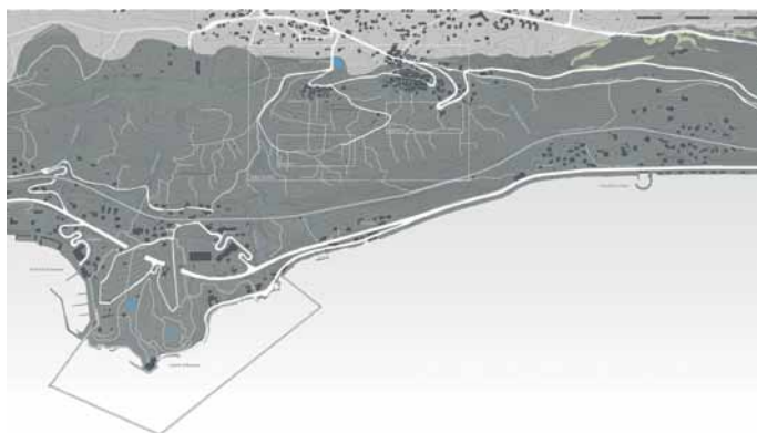
Figure 2: The network of paths shows a few connections between the Karst ridge and the sea, overcoming the barriers formed by the coastal road and the rail routes which have interrupted many of these connections.

and connected by widespread newly formed buildings. The landscape context identified by the centre is bordered to the east, west of the village of Duino, the countries that border the Karst ridge to the north and south of the sea. The centres included in this area have historically been characterised by being tied to the sea, despite the great differences in altitude. The villages situated on the ridge, Visogliano, Aurisina, Santa Croce, Dulanjavas and Contovello, thus form a group characterised by direct connections with the coast, such as by passing fishermen to reach fishing spots, which still mark the area.