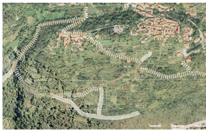
Figure 13: The authenticity of the network of paths will be reduced following the implementation of the project.

Slika 13: Avtentičnost mreže poti se bo po izvedenem projektu zmanjšala.