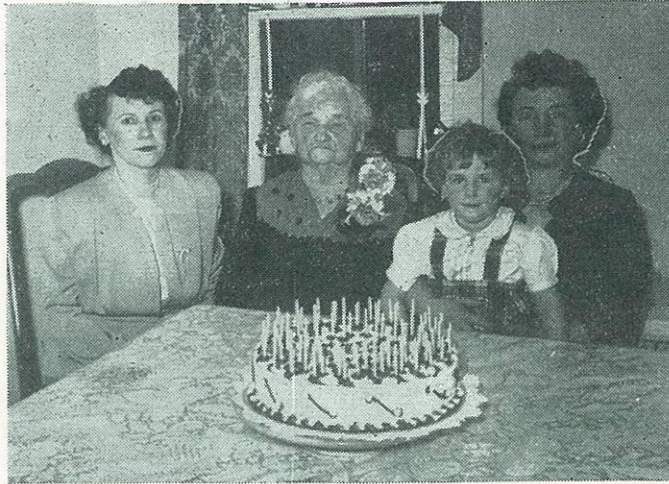
FOUR GENERATIONS IN EVELETH, MINNESOTA