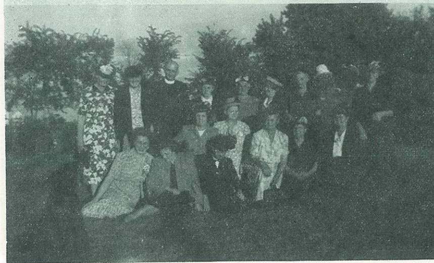
DULUTH, EVELETH IN HIBBING, MINNESOTA