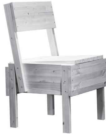
Fig. 1: Enzo Mari, Proposta per un'autoprogettazione, 1974.

I refer here to the thought and work of Italian designers such as Enzo Mari and the radical “antidesign” movements united in the Superstudio and Archizoom collectives. Seeing as how most designers accept the widespread notion that design should be subordinate to the market and function as a catalyst for consumerism, Mari and both groups turned their critical gaze inward, towards the design practice. With this self-criticism, they wished to subvert the foundations of uncritical, toothless design, which does not recognise (as well as does not look for) an alternative outside the given (and seemingly immutable) frames of the established market logic. This is precisely what Mari and both collectives offered: an alternative that would shatter social dogmas. Mari stated: