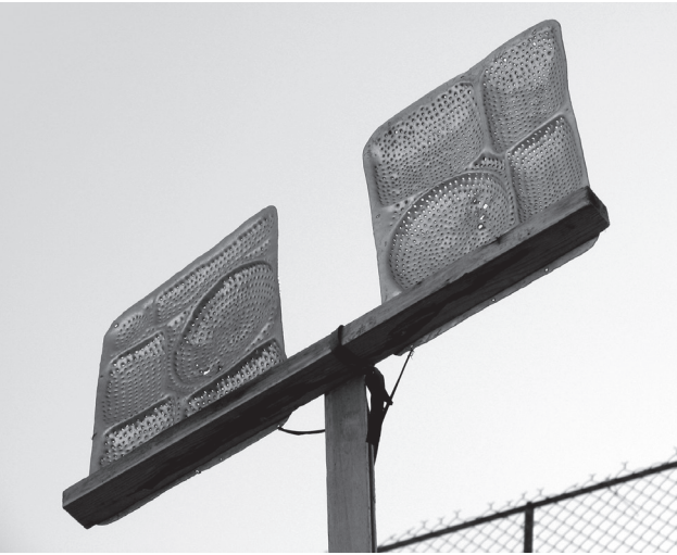
Fig. 3: Ernesto Oroza, Technological Disobedience: TV aerial made out of standardised metal trays from public diners, Havana, 2005.

commodity? The authors' cogent response focuses on users empowered by freely shared knowledge. Individuals are tasked with finding their own answers to the given neutral network of knowledge and ideas, to the given set of blocks of material. Their task is to create a new use and to become active participants in the process of creating, and subsequently to reject the role of consumers that was defined by the Other. We are, once again, reminded of the designers from Superstudio, who presented – as far back as 1972 – the following demand: only by rejecting objects of possession, or, better yet, by eliminating objects prescribed in advance by the Other, will design finally evolve into a means of knowledge and thus become a foundation for real human existence. Namely: