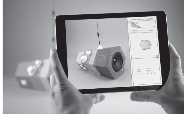
Fig. 2: Jesse Howard, Leonardo Amico, Tilen Sepič, Thibault Brevet, Cloning Objects , 2015.

object will address our needs, the decision as to its nature and design is ours alone. “Objects can now be designed, developed, and produced democratically, rather than through a top-down approach from corporation to consumer.” 18 In Cloning Objects the product contains embedded information needed for its re-production. Although products can still be distributed through the existing network and could even be manufactured within this network, individuals may also freely produce, modify, and redistribute the pieces as they see fit. 19