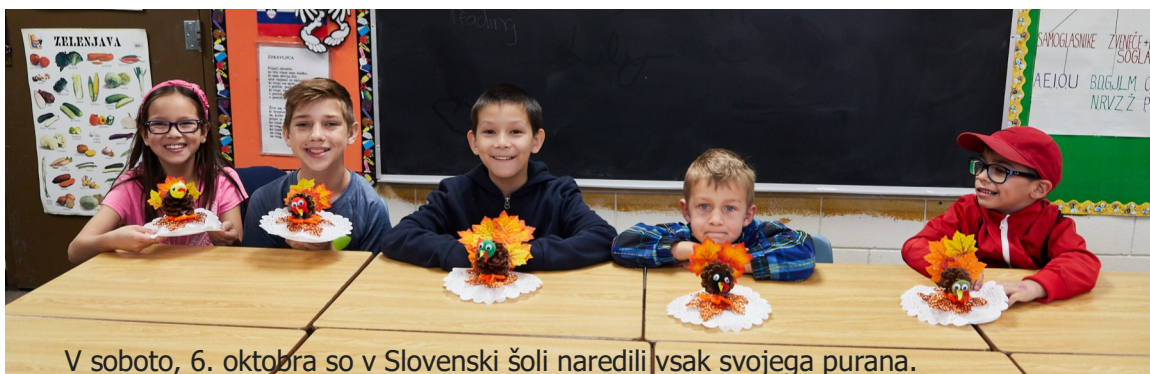
V soboto, 6. oktobra so v Slovenski šoli naredili vsak svojega purana.