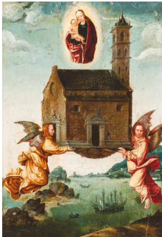
Transfer of the House of Mary, oil on wood, anonymous painter, Brügge, 16th Century.

So what follows from all of this for our placeless chapel? I believe that now our task would be to consider and acknowledge the void of the modern subject as well as the actual and spiritual homelessness of contemporary people, then to embrace it, and fill it with ambivalent meaning. Here, Nazareth offers yet another mythical and performative concept in the Loreto cult. The upper church of the Basilica and the surrounding cloister walls are covered with images of Mary, donated by pilgrimage places from all over the world. Whilst this might quite rightly remind of Catholic imperialism, it refers especially to the narrative of the angels that in the 13th Century were said to have carried Mary's house to the Italian pilgrimage place of Loreto, from where it was relocated in the 16th and 17th Century in numerous Loreto chapels in Central Europe as a physical embodiment of the mythical multiplicity of life and sacred space. In this concept, and its manifold realisation Mary's house is present, but also absent, and simultaneously present all over. I don't know if the placeless chapel will ever be built, but I believe that in this idea it could find a place.