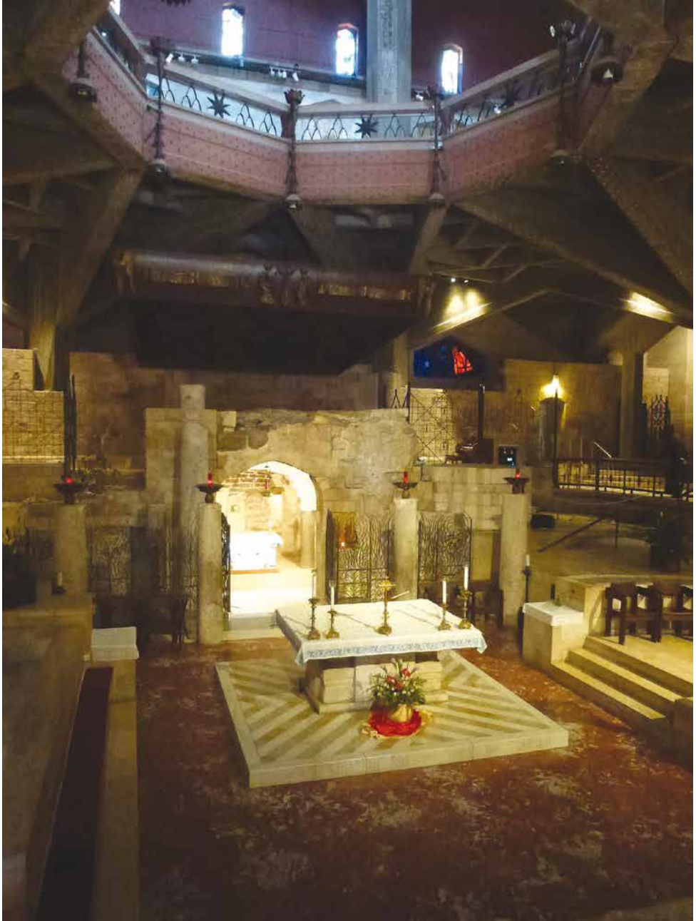
View towards “Mary’s house” in the Church of the Annunciation. Nazareth, 2015.