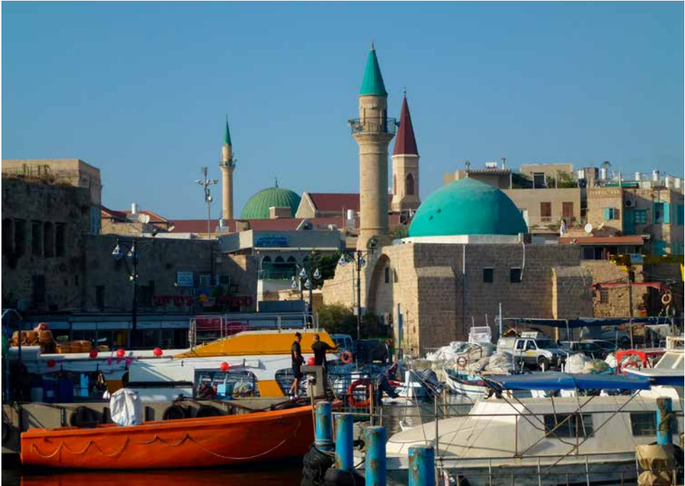
The old town of Akko, Israel, 2015.

and tooting; all overlaid with the sounds of religion, church bells, and especially the Muezzin calls. Five times a day they proclaim their power of ordering, but are at the same time counteracted by everyday life. I observe how a group of young men take the melody up that waves down from the minaret, and then drown it with their MP3 players; or, in the silent yard of Acre's Great Mosque, how some women follow the call for prayer to the side entry, whilst others keep on chattering. In this way, the secular and the sacred create one space as a heterogeneous weave, in which rules and norms can be known and broken, difference is recognised and transcended. 3 In this way, religious space sums up the idea of life as a liminal passage towards a different other, from the univocal to the polyphonic.