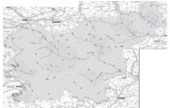
Slika 3: V naselbinskih območjih in naseljih s kvalitetno stavbno dediščino uveljavljamo prenovo kot prednostno razvojno strategijo.

In populated areas and settlements with quality built heritage rehabilitation is promoted as the primary development strategy.