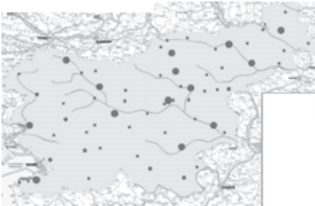
Slika 2: Spremembe v načinih pridobivanja dohodka v posetni ekonomiji so povzročile opuščanje pridelovalnih zemljišč in spremembo odnosa z naravnim, kmetijskim okoljem. Changes in manners of obtaining income in land ownership economy have caused abandoning of cultivated land and changes to attitudes to natural, agricultural environments.

According to spatial-development potentials particular settlements will develop their central role and primary orientation. The latter will mainly depend on the wider area's development strategy, which can be exceptionally protective (natural landscape), agrarian (intensive agricultural landscape) or follow moderate trends of countryside urbanisation (cultural landscape less intensive agricultural areas). Intensive agriculture will most significantly affect structural layout of the settlements without central significance, which will totally adapt to technological (expansive agrarian production buildings) and spatial (replotting of land) demands. Settlements will integrally add to their status and central significance.