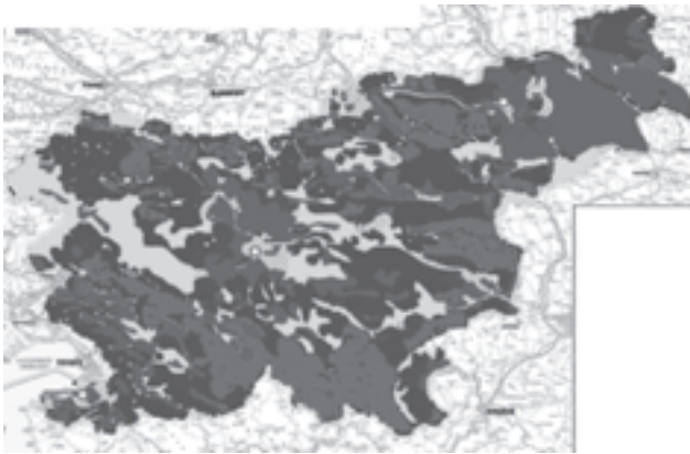
Slika 1: V skladu s prostorsko-razvojnimi potenciali bodo posamezna naselja razvijala svojo središčno vlogo in primarno usmeritev. Slednja bo odvisna predvsem od strategije razvoja širšega območja, ki bo izrazito varovalna (naravna krajina), agrarna (kmetijsko intenzivna krajina) ali pa bo sledila zmernim trendom urbanizacije podeželja (kulturna krajina manj intenzivna kmetijska območja). Intenzivno kmetovanje bo najbolj vplivalo na strukturno zasnovo naselij brez središčnega pomena, ki se bodo v celoti prilagodila tehnološkim (obsežni agrarni gospodarski objekti) in prostorskim (komasacije zemljišč) zahtevam. Naselja bodo integralno nadgrajevala svoj status in središčni pomen.

According to spatial-development potentials particular settlements will develop their central role and primary orientation. The latter will mainly depend on the wider area's development strategy, which can be exceptionally protective (natural landscape), agrarian (intensive agricultural landscape) or follow moderate trends of countryside urbanisation (cultural landscape less intensive agricultural areas). Intensive agriculture will most significantly affect structural layout of the settlements without central significance, which will totally adapt to technological (expansive agrarian production buildings) and spatial (replotting of land) demands. Settlements will integrally add to their status and central significance.