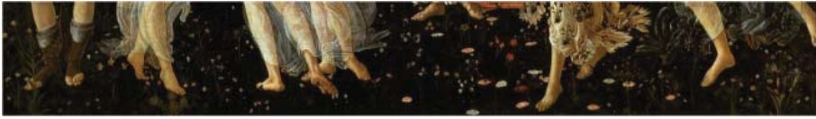
Fig. 12: Sandro Botticelli, Primavera (detail), around 1482, Uffizi, Florence.

The metaphor on Apelles and the meadow assists us in penetrating the thought that the soul contemplating the angel temporalises eternity or, in Ficino's words which also reflect a certain metaphor, "this movement properly does flow out of the soul's own nature as its own fountain of movement defined as activity within time; but it is aroused by those above, as by a beginning and end outside itself" (Ficino, 2001, 229). The meadow may be understood as a metaphor of the Platonic "world of ideas" that the soul "reads" in time, but when it ascends to the angel, intellect and/or spirit, it instantly contemplates its totality while keeping all the details in view. A painted work of art is a moment "stopped" in eternity, it is the panopticum of the world that the soul experiences in space and time. We presume that Leonardo da Vinci regarded painting higher than any other form of art (I do not argue here that he was right, probably not) also due to its Platonic, "angelic" totality, represented in a painting. In A Treatise on Painting we read: "Painting manifests its essence to thee in an instant of time ,—its essence by the visual faculty, the very means by which the perception apprehends natural objects, and in the same duration of time ,—and in this space of time the sense-satisfying harmony of the proportion of the parts composing the whole is formed" (Leonardo, 2005, 19, italics M. U.).