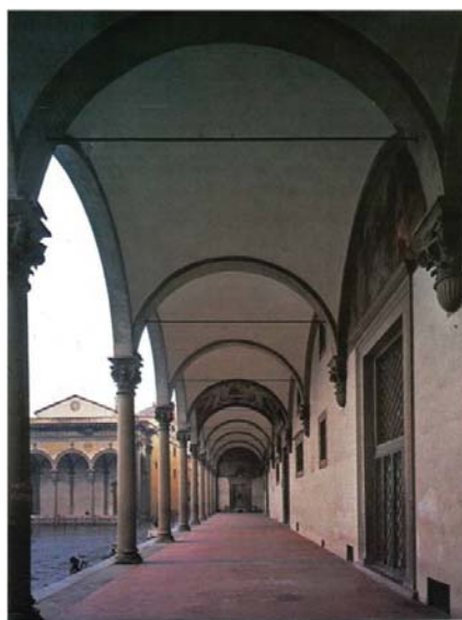
Fig. 2: The colonnade in front of Ospedale degli Innocenti. Both were designed and built by architect Filippo Brunelleschi in the mid-15 th century.

In Renaissance architecture the location of a beholder is characterised by the visual connection between the interior and the exterior of buildings. Filippo Brunelleschi was the master of linking the interior with the exterior, which is seen, for example, when