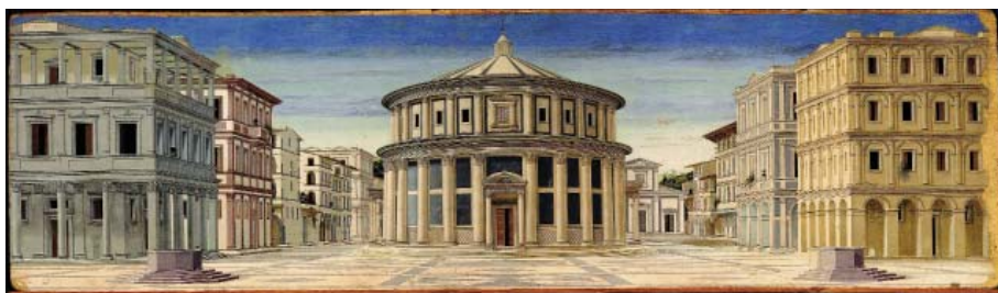
Fig. 5: Luciano Laurana (?), Ideal City , 15 th century, Galleria nazionale delle Marche, Urbino.

The Renaissance also brings forward architectural utopias, that is, paintings of “the ideal city” ( città ideale ). One of them may be seen in the Ducal Palace of Urbino (Fig. 5). The utopia, i.e. “the place which does not exist” (literally, “no place”), stems from Antiquity, from Plato's Republic as well as from Plotinus' idea according to which he would build Platopolis , the city of philosophers, with the help of the Roman emperor Gallienus (3 rd century). Thomas More was the first to use the term Utopia , namely, in 1516 as the title of the book in which he imagined the ideal city (or state) in terms of a social and political project in order to criticise the growing social stratification of early capitalism. Nevertheless, it is already in the paintings of the Quattrocento that there emerge utopian cities characterised by “geometry” or urban planning which were influenced by the Florentine Platonism inspired by “Platonic ideal solids” (regular polyhedra in Timaeus ). Although it seems that the human being is almost absent from such cities, small and lost as he is in the middle of high and accomplished architecture, a human/a beholder is very much present in the perspective, i.e. in the invisible “foreground” as the observing, seeing, thinking subject – of course, this gaze is not the gaze of an angel, it is not even classically Platonic, but the gaze of a human , the gaze from the “location” of an individual soul. 2