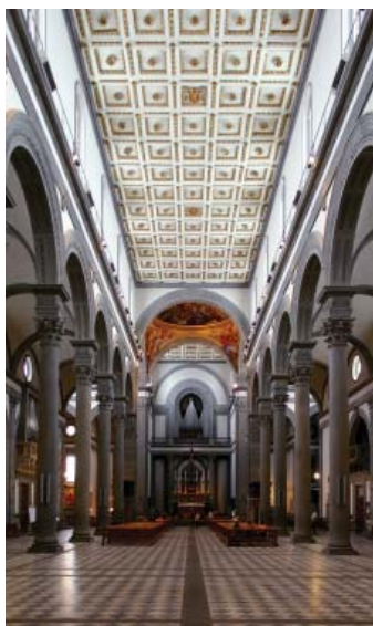
Fig. 1: The interior of the Basilica di San Lorenzo (Basilica of St Lawrence). ("Einblick LH2 San Lorenzo Florenz" by Stefan Bauer.)

Consequently, the emphasis on the individual soul denotes that the soul in Ficino's Renaissance (Neo)Platonism, as is generally the case with Renaissance philosophy, becomes increasingly linked with space and time, or, in other words, the soul becomes increasingly through one's body, of course – located in space and time. It is precisely the very “location of the soul” or rather its gaze which is essentially associated with the Renaissance discovery of perspective , of “viewpoint”. The term ‘perspective’ stems from the Latin word perspecto – “I look through”, meaning through “the window” of a two-dimensional picture into a three-dimensional space. The perspectival “illusion” is made possible by two means: the Euclidean geometry and the location of the beholder's viewpoint, the subject of seeing. As is generally accepted, the principles of perspective were discovered in the early Renaissance art predominantly by two painters, Masaccio and Piero della Francesca, and the architects Brunelleschi and Alberti. The latter introduced the notion of a “visual pyramid” stretching from the eye or viewpoint, thus forming its apex boundlessly far away in space, whereas in a picture it is represented by one of the rectangular flat planes of the pyramid.