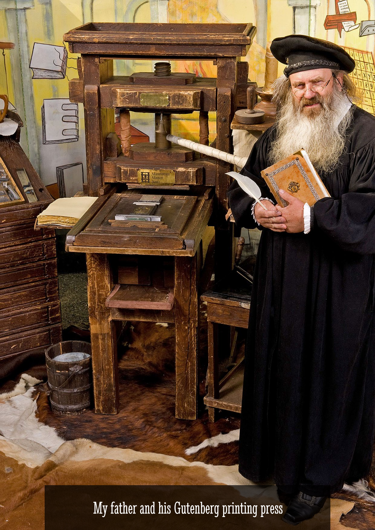
My father and his Gutenberg printing press