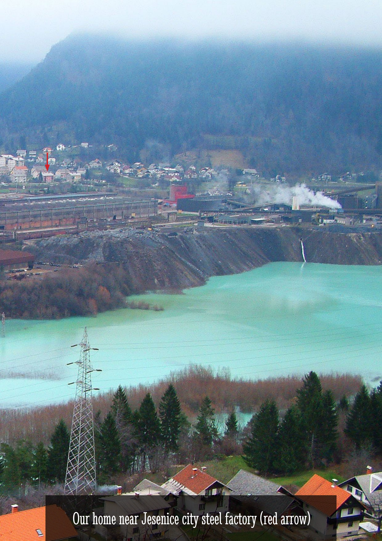
Our home near Jesenice city steel factory (red arrow)