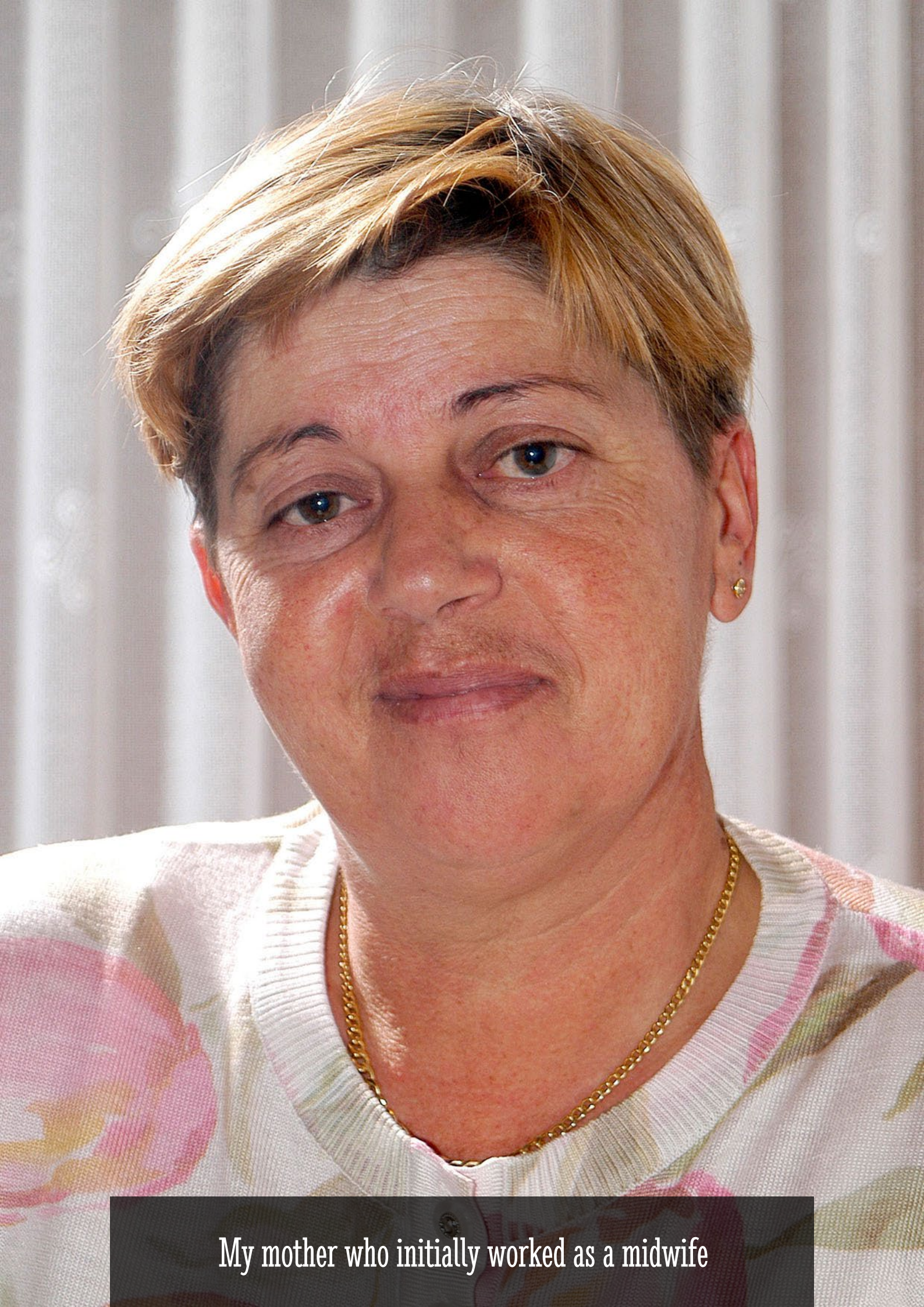
My mother who initially worked as a midwife