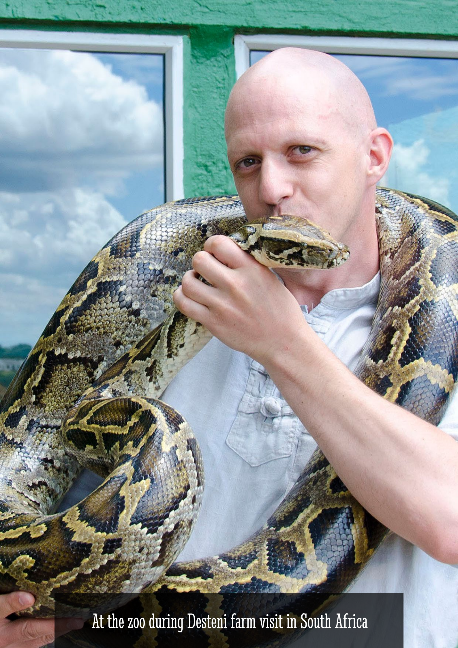
At the zoo during Desteni farm visit in South Africa