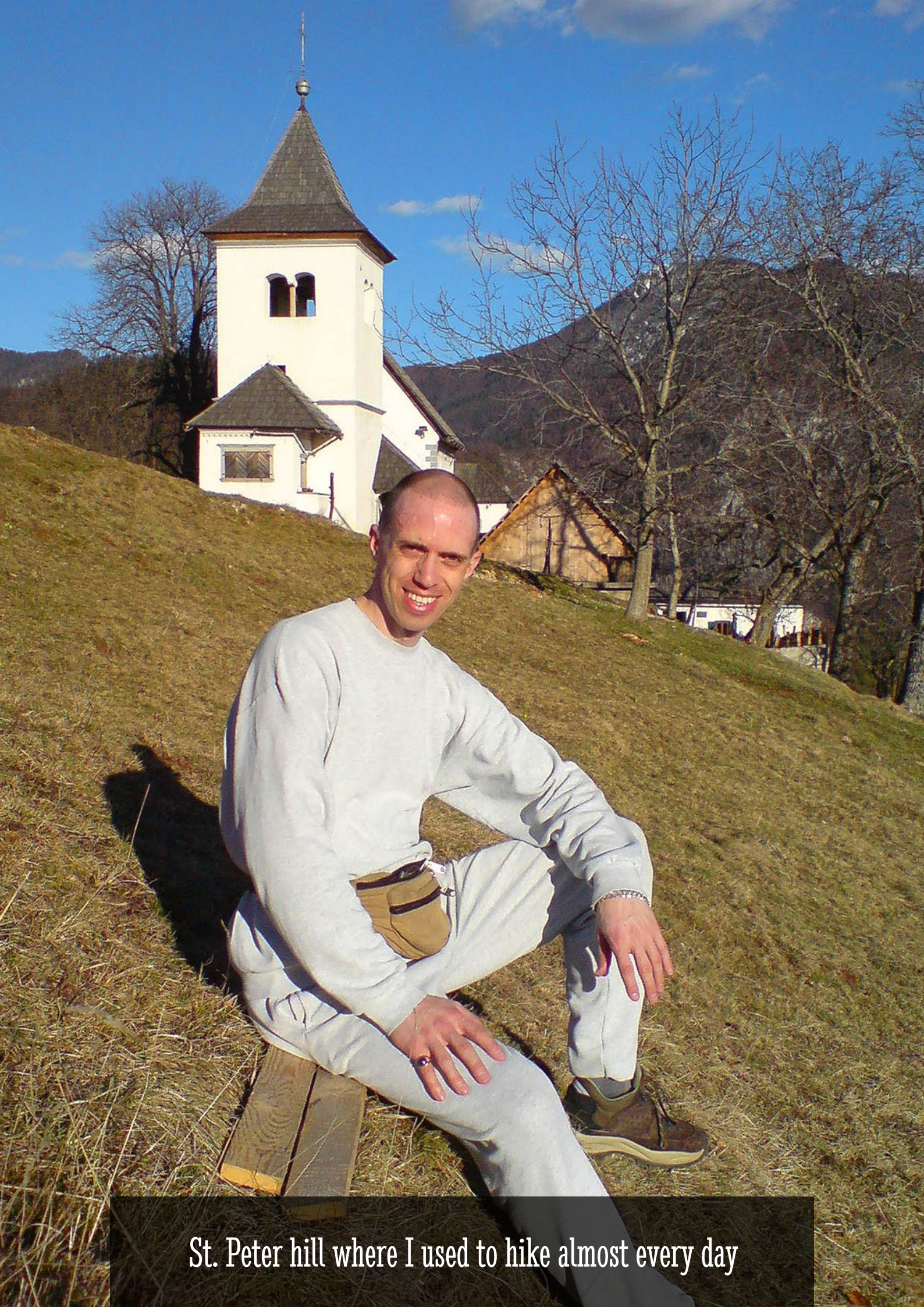
St. Peter hill where I used to hike almost every day