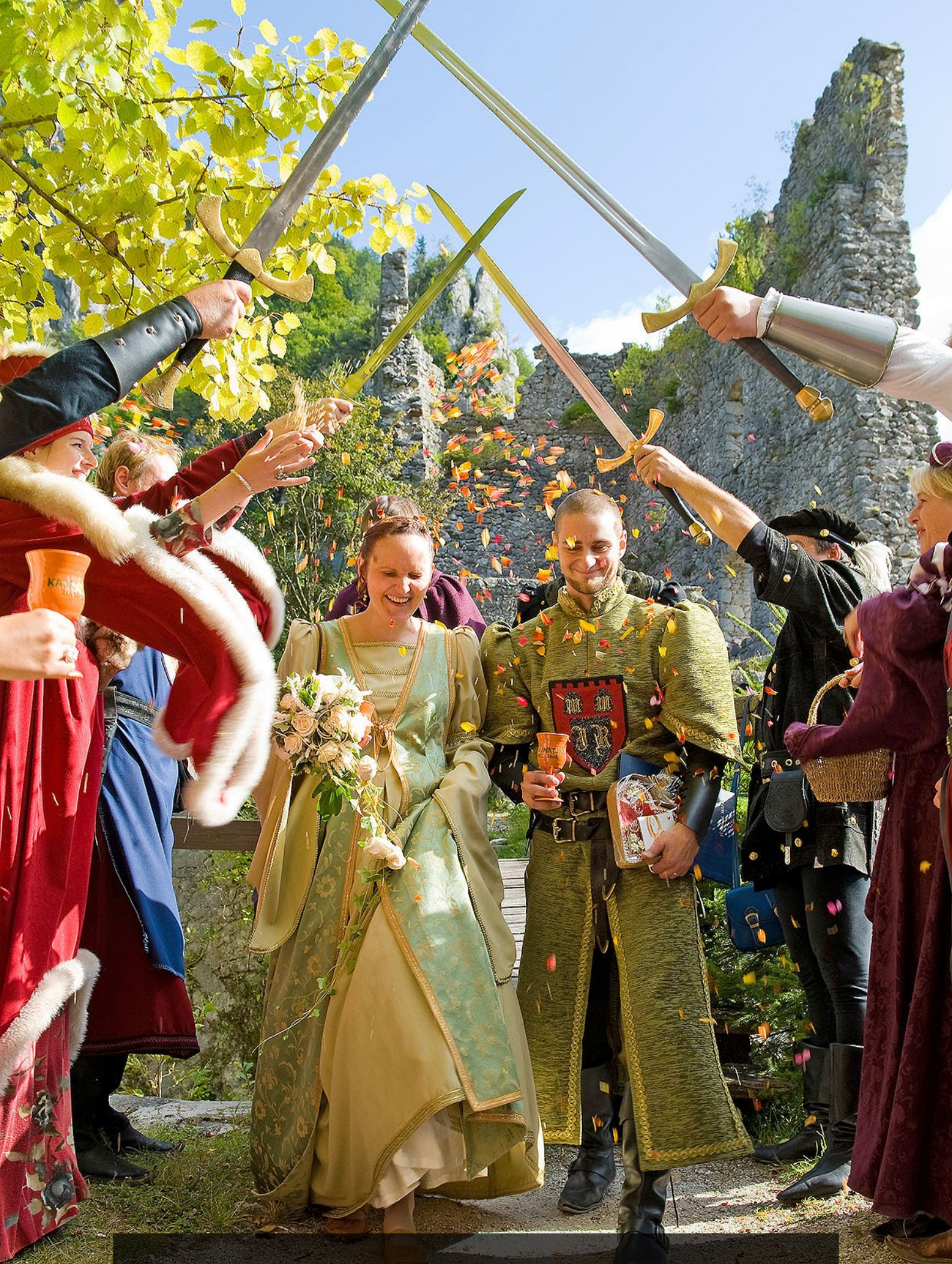
One of many fascinating weddings that I shot