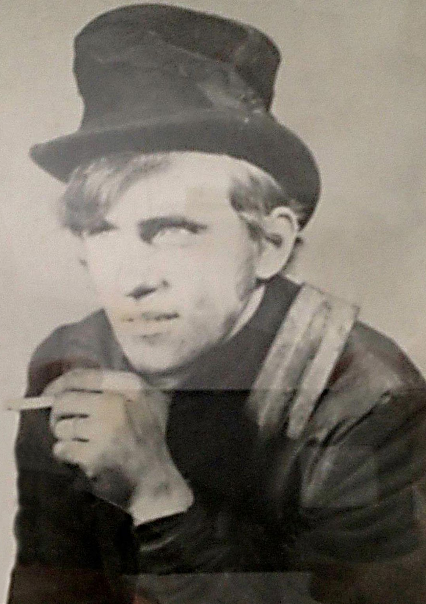
My father in his early years as a chimney sweep