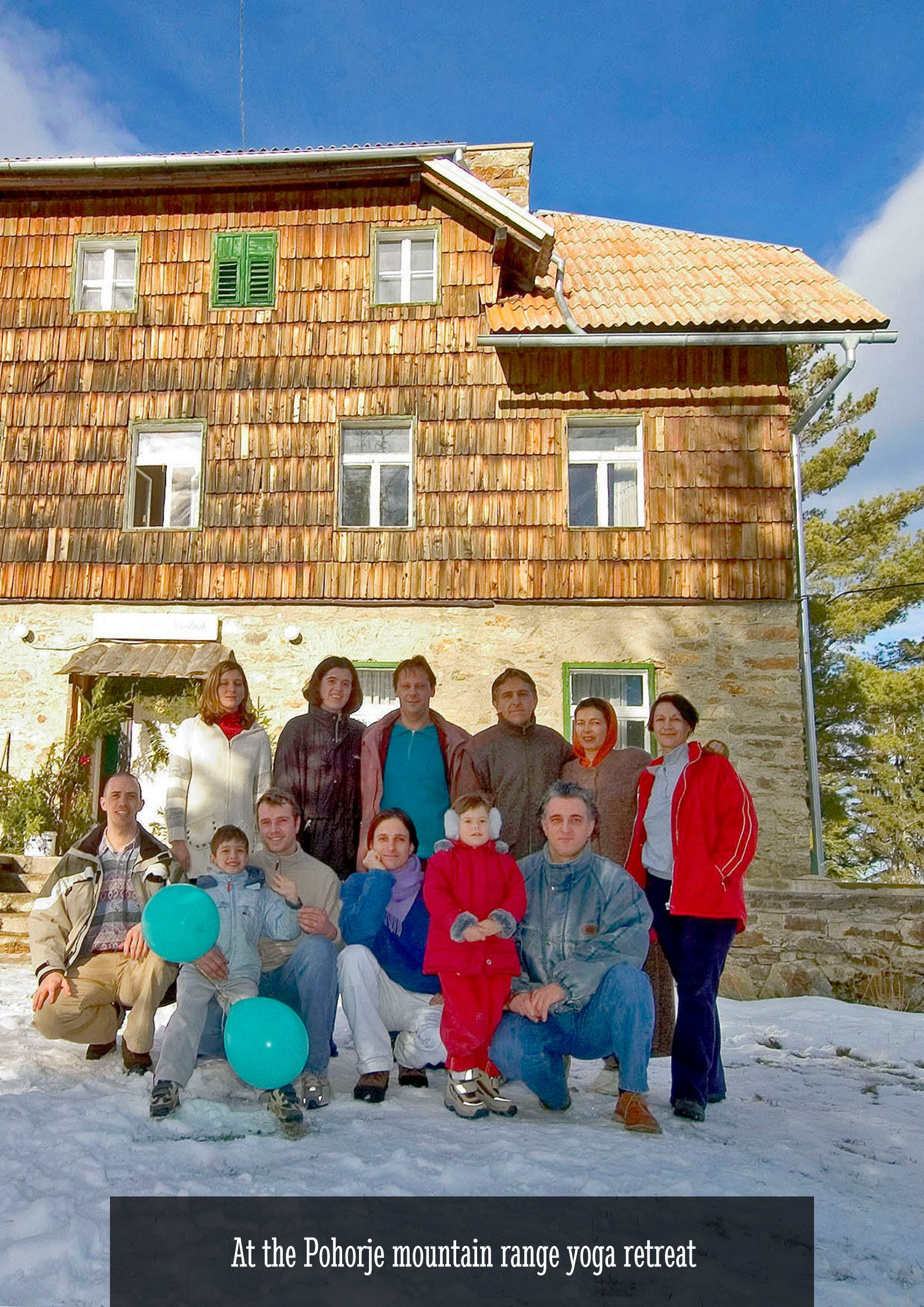
At the Pohorje mountain range yoga retreat