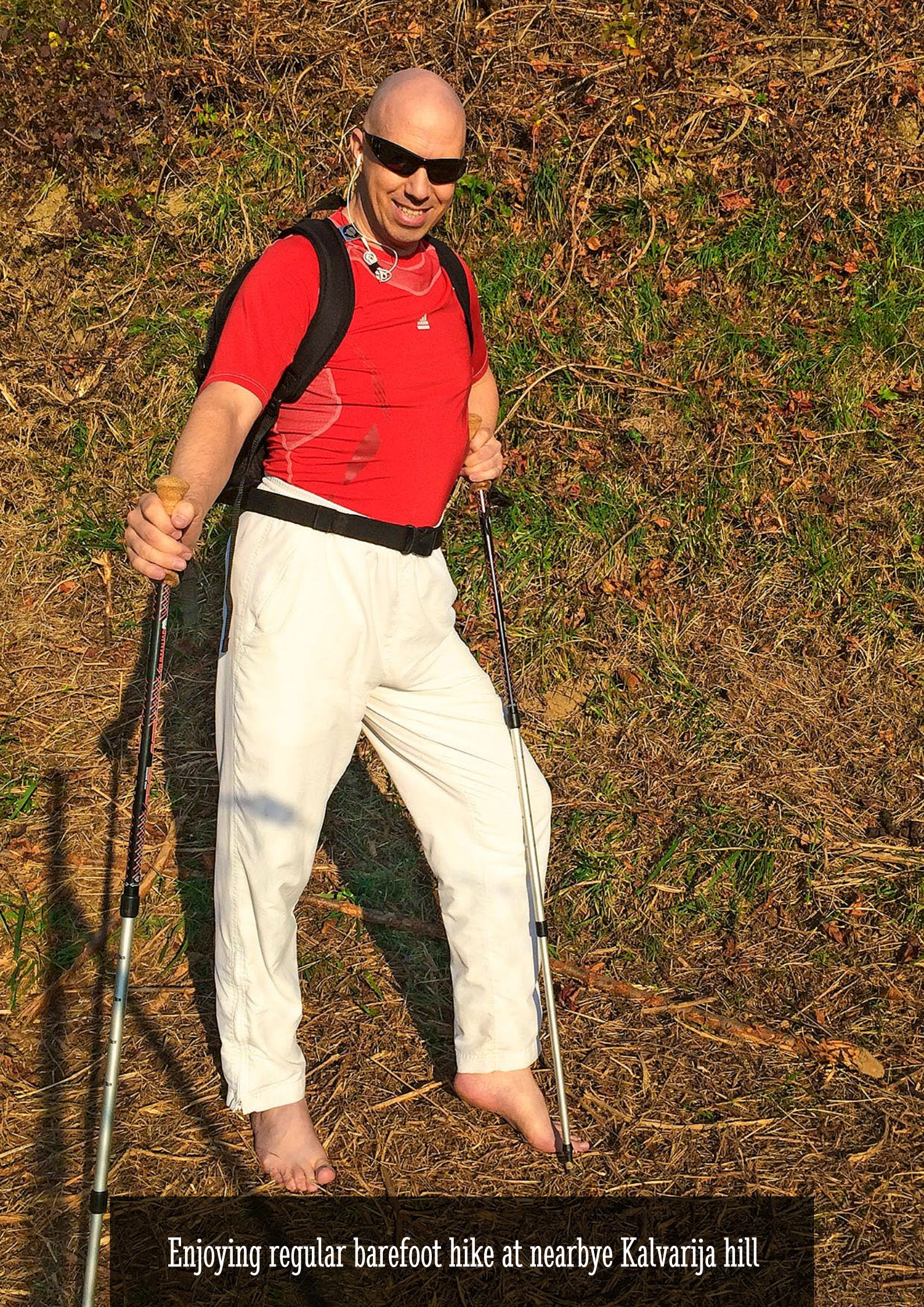
Enjoying regular barefoot hike at nearby Kalvarija hill