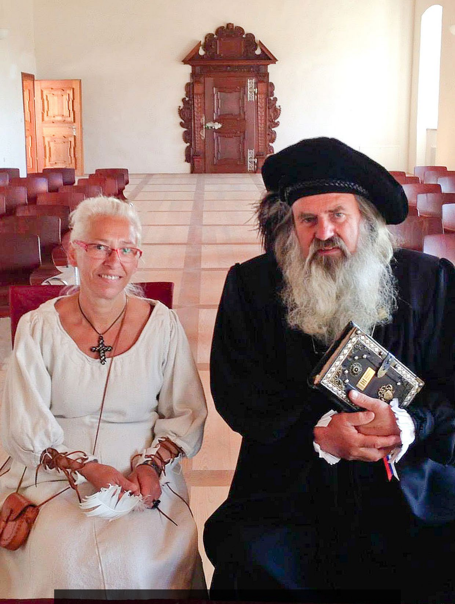
My stepmother and my father during medieval festival