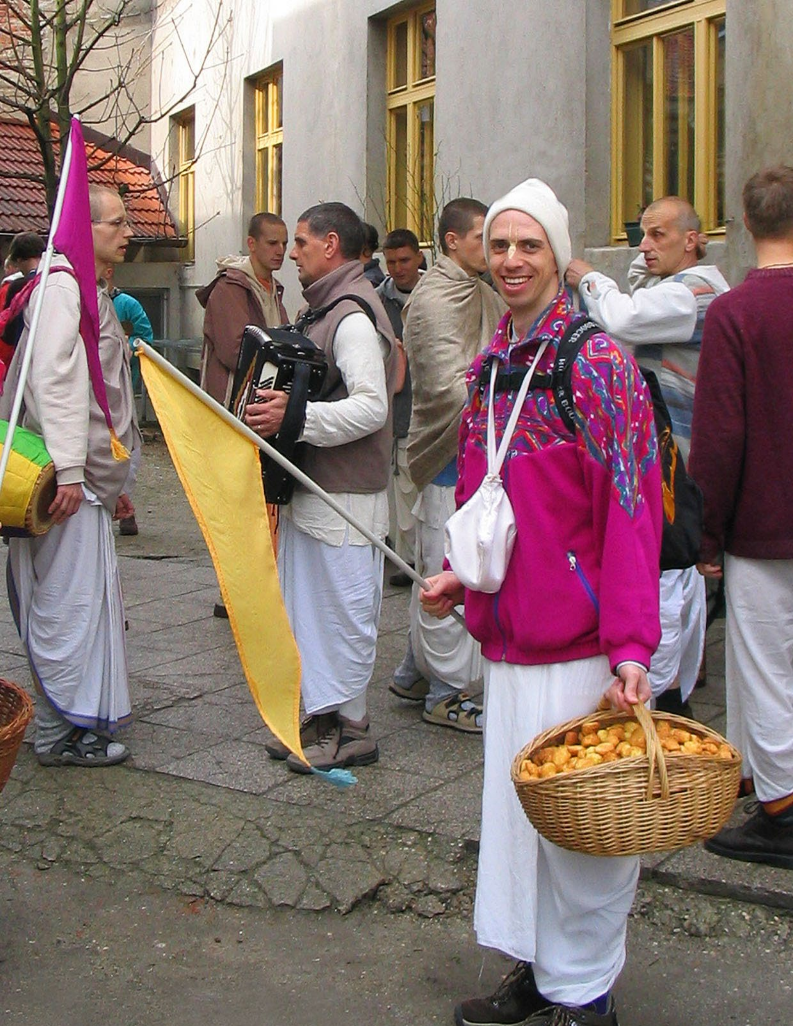
Participating at the Hare Krishna harinam