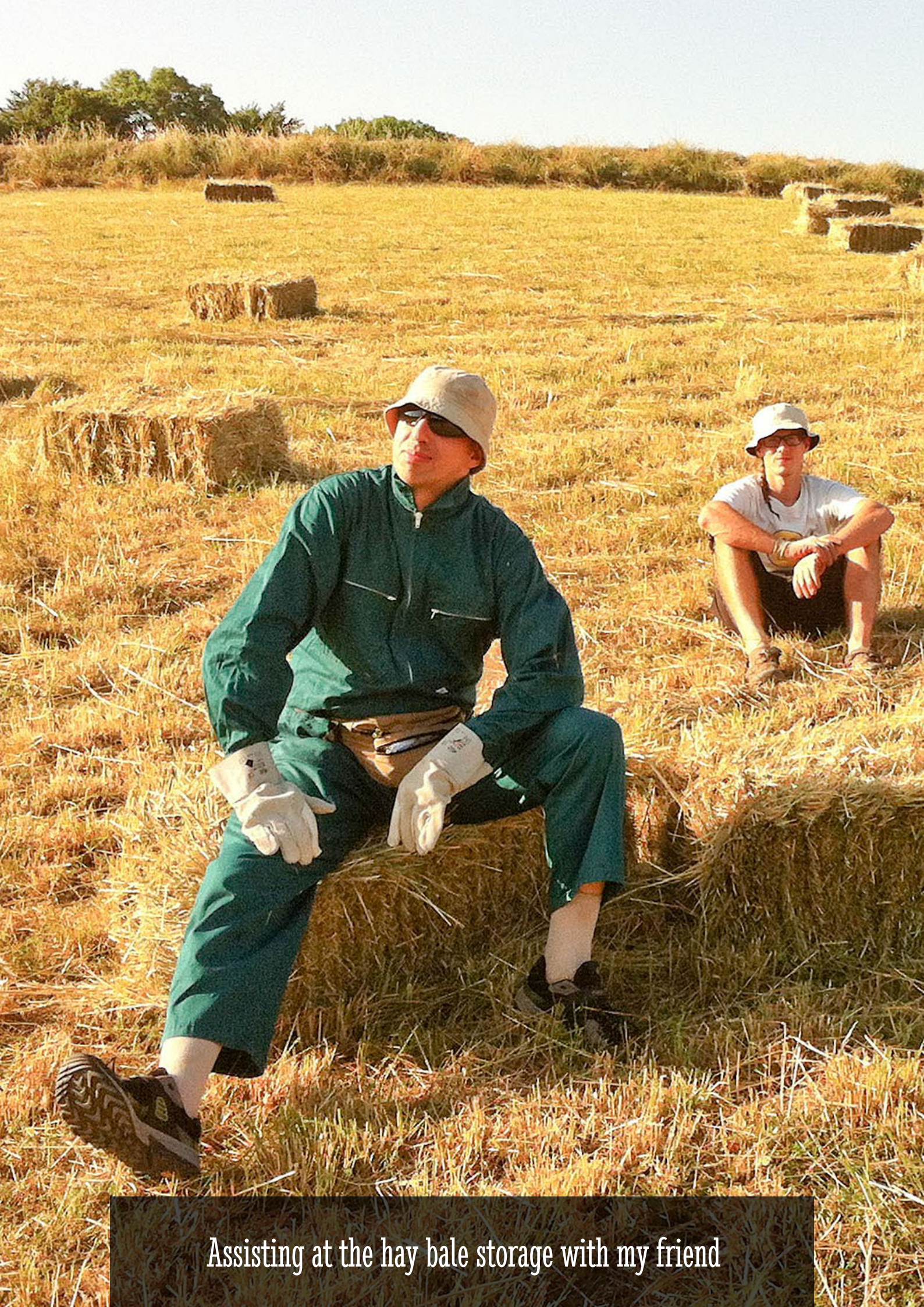
Assisting at the hay bale storage with my friend