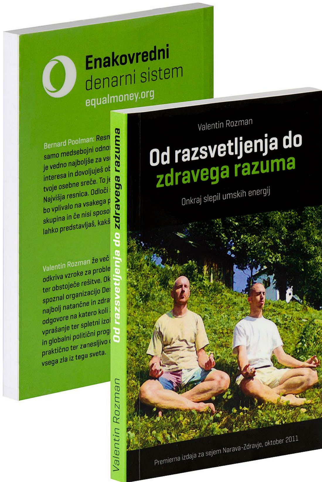
Front and back of my 1st book, published in 2011