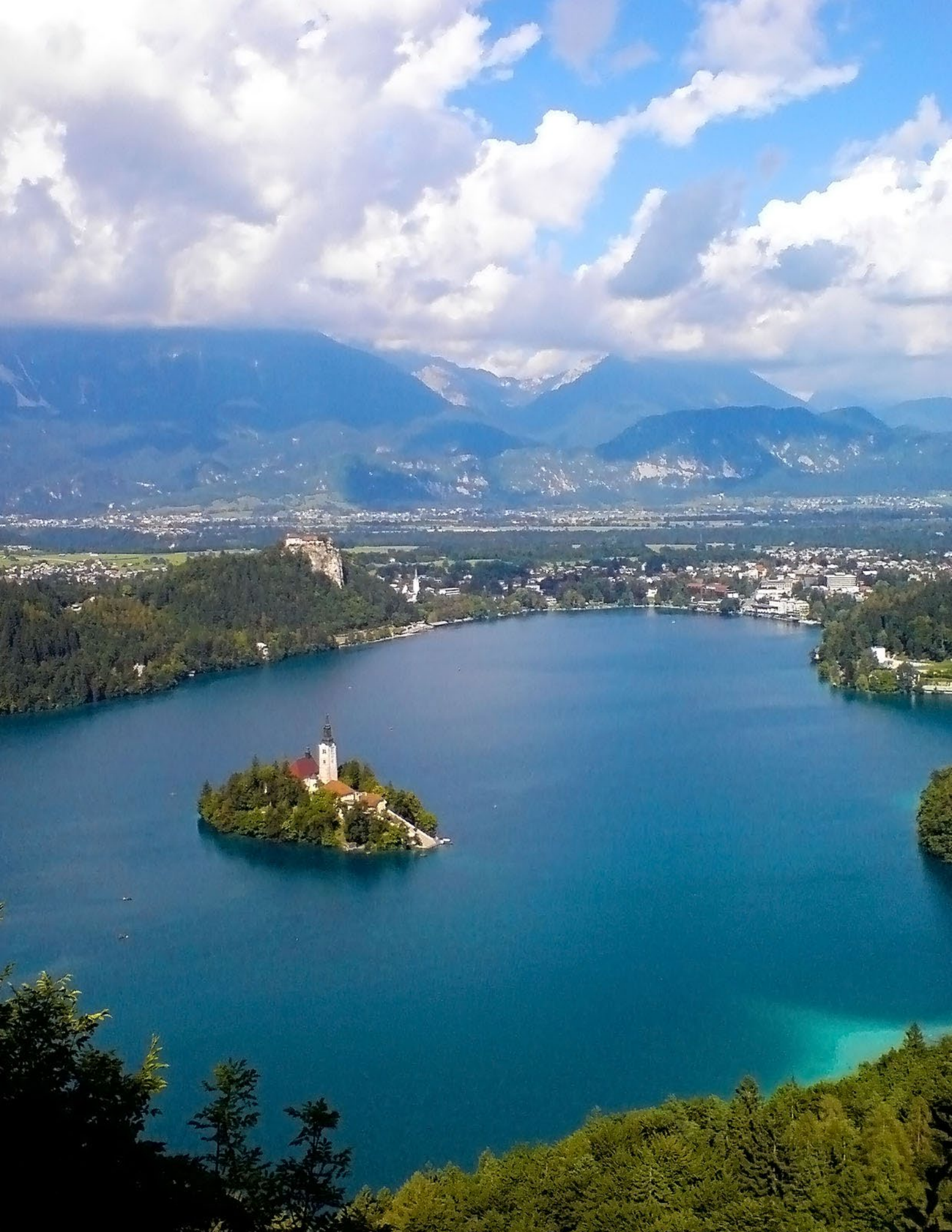
Bled city where I worked as a wedding photographer