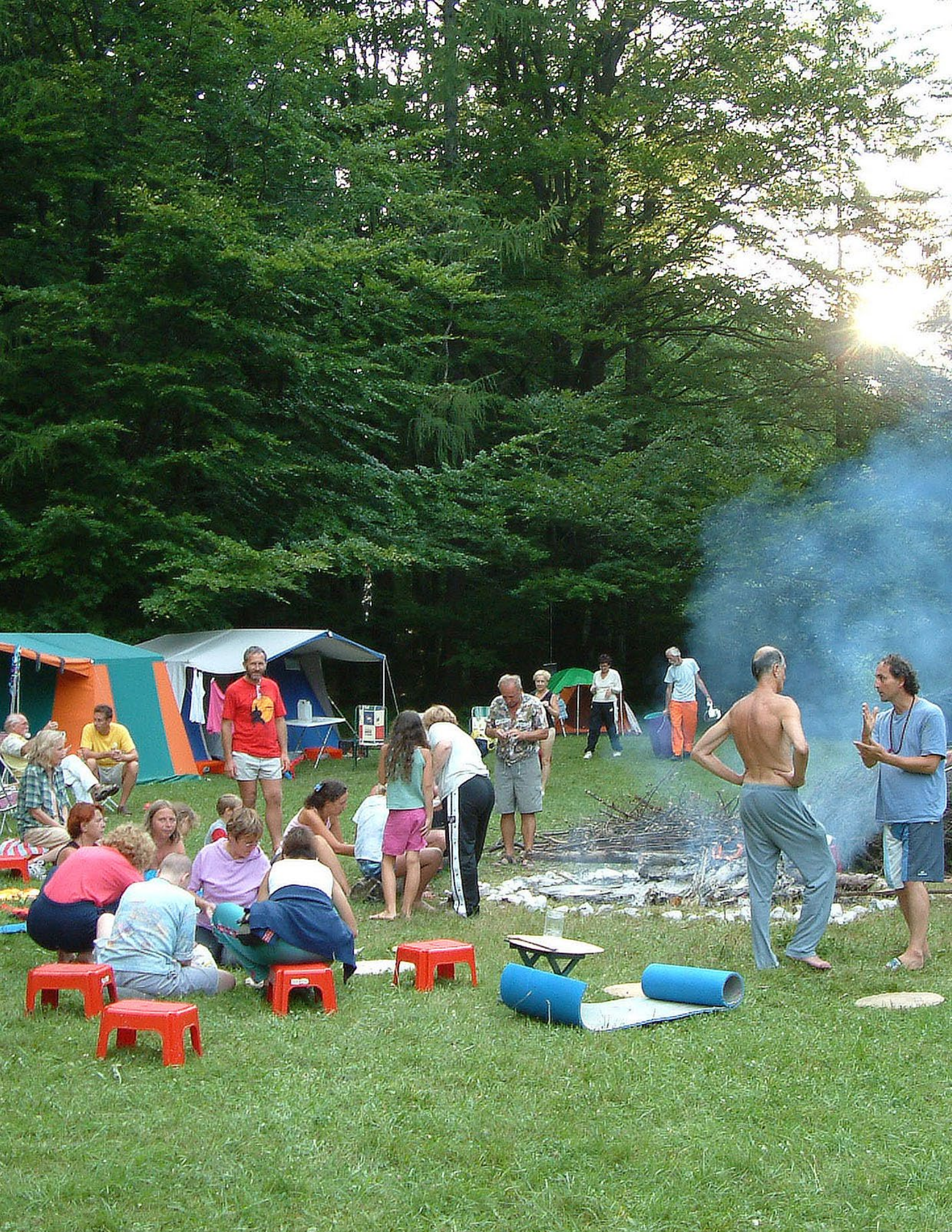
Spiritual camp near Martuljek river confluence