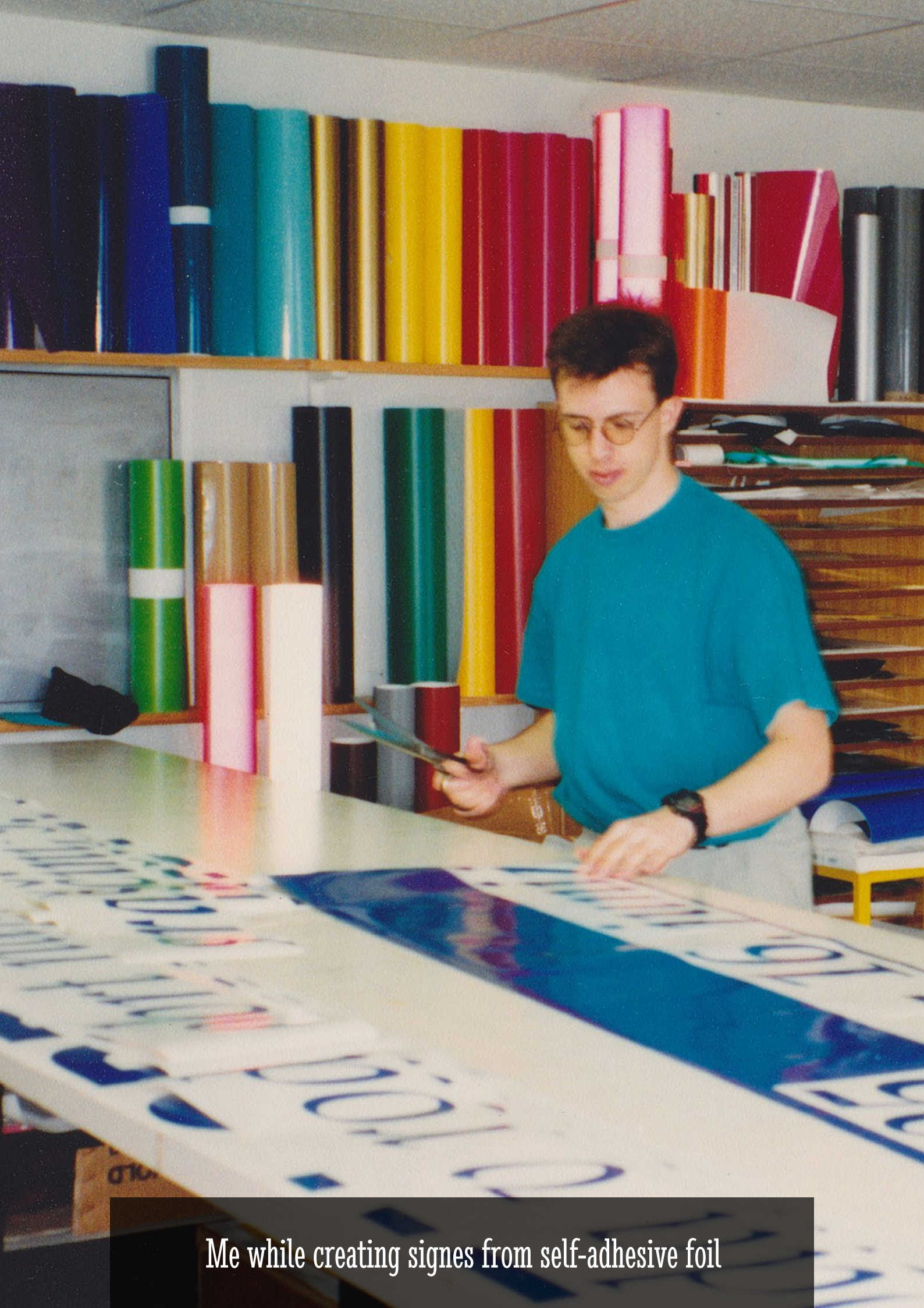
Me while creating signs from self-adhesive foil