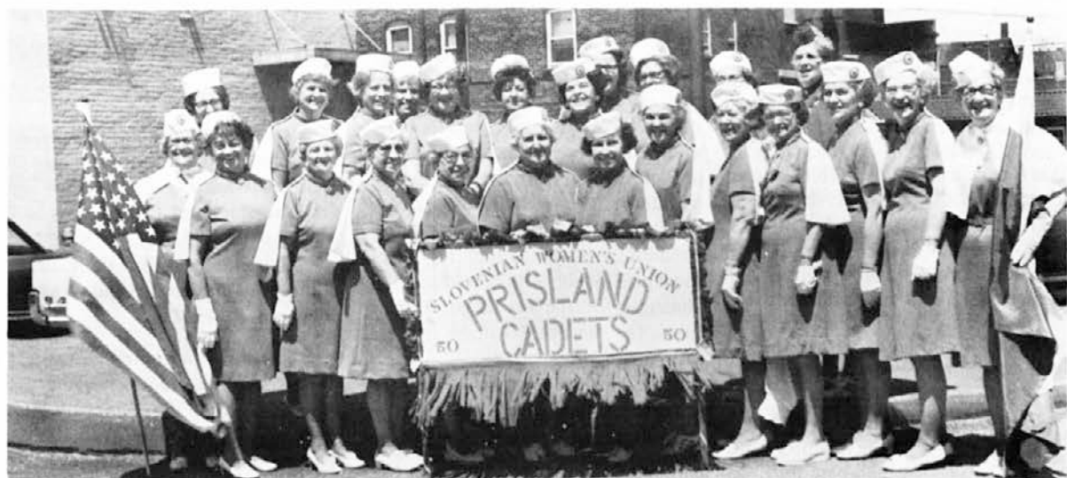
Recent photo of the Cadets at one of their many appearances