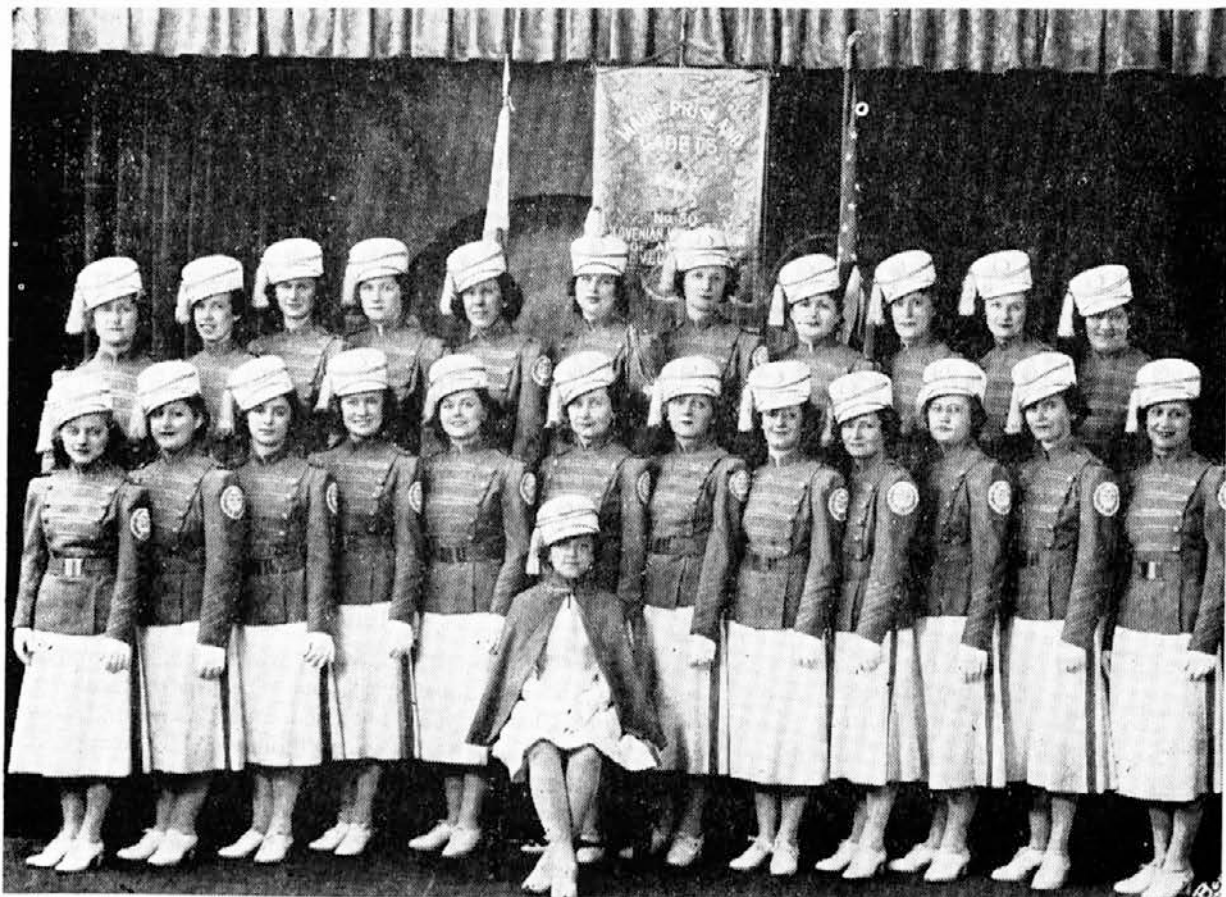
MARIE PRISLAND CADETS, NO. 50, S.W.U., CLEVELAND, OHIO

One of the first outstanding performances was at the fourth regular convention in Milwaukee, Wisconsin in May, 1936. The cadets raised enough money for their fare and also new uniforms which were made of wool serge. It was at this convention that the universal love for drill teams was born, for after this time, the drill teams were being organized all over the jurisdiction of SWU. At this convention the drill team adopted the name of