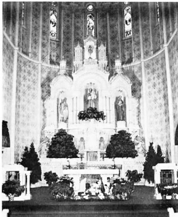
St. Joseph's Church Joliet, Ill.