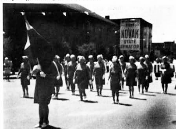
"Left, right," — marching down St. Clair