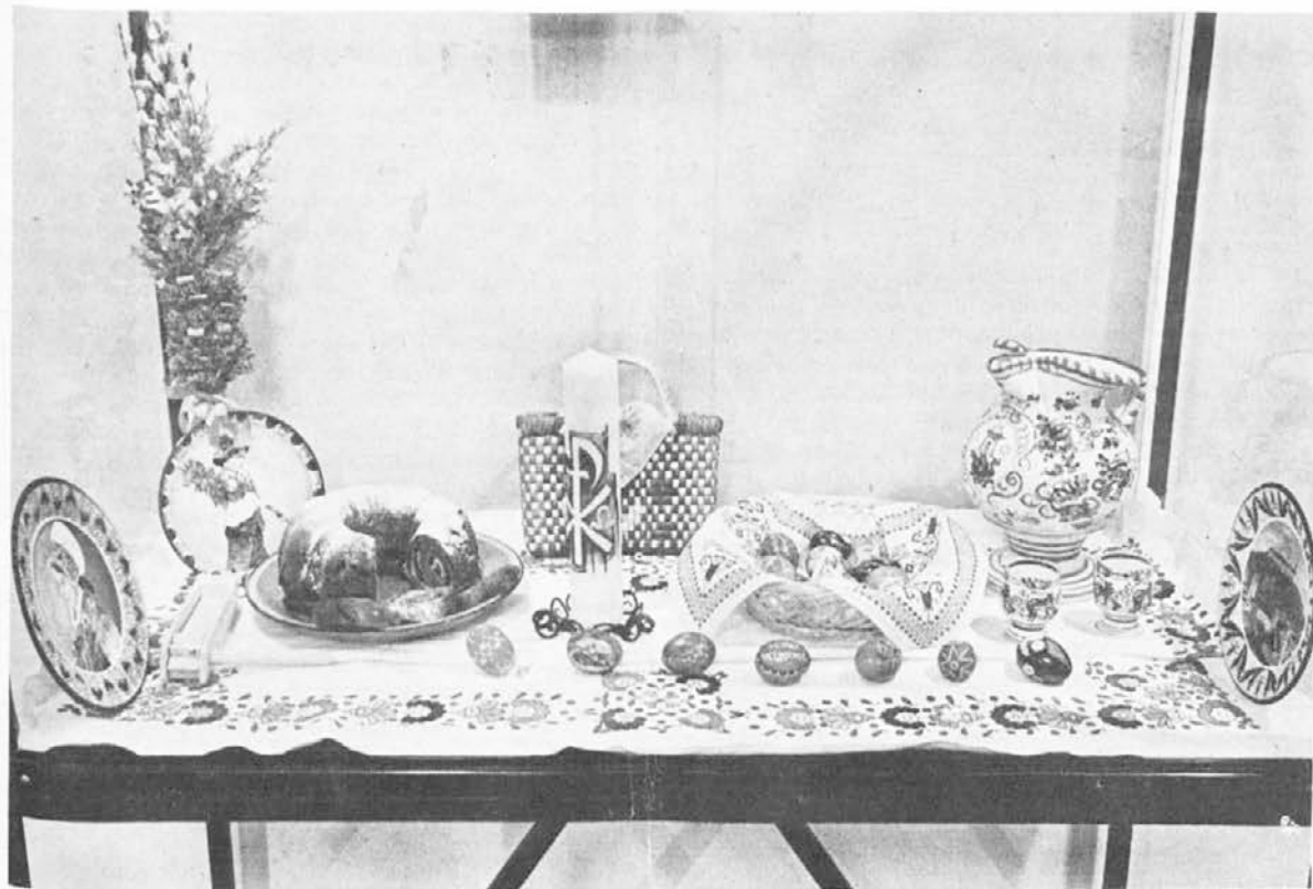
Slovenian Easter art on display at the Museum of Science & Industry, Chicago, Illinois