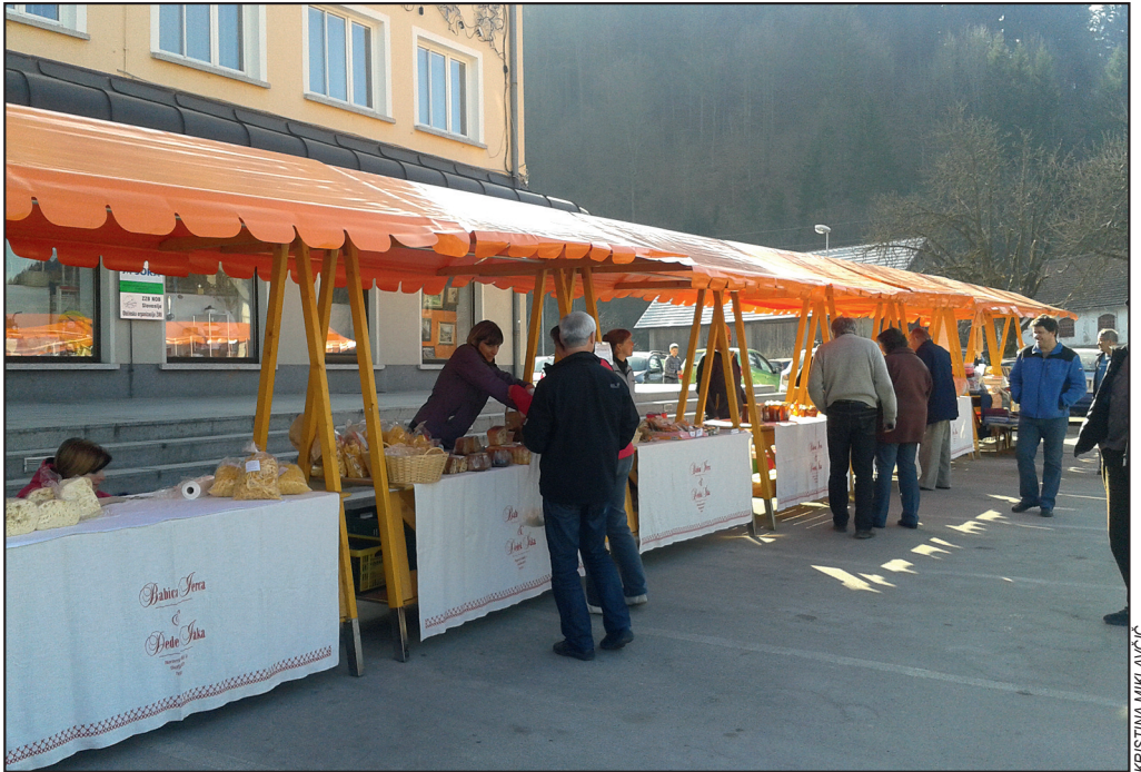
Figure 3: Weekly food fair in the Municipality of Žiri.