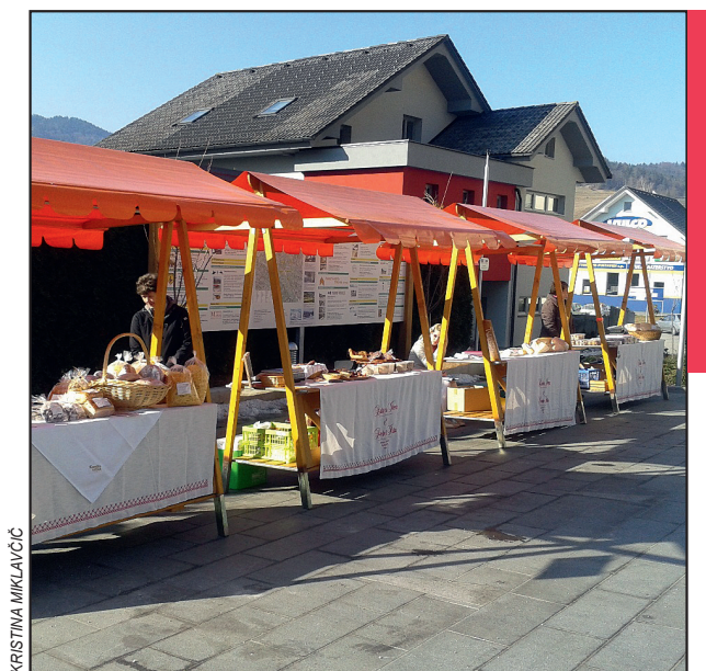
Figure: Weekly food fair.