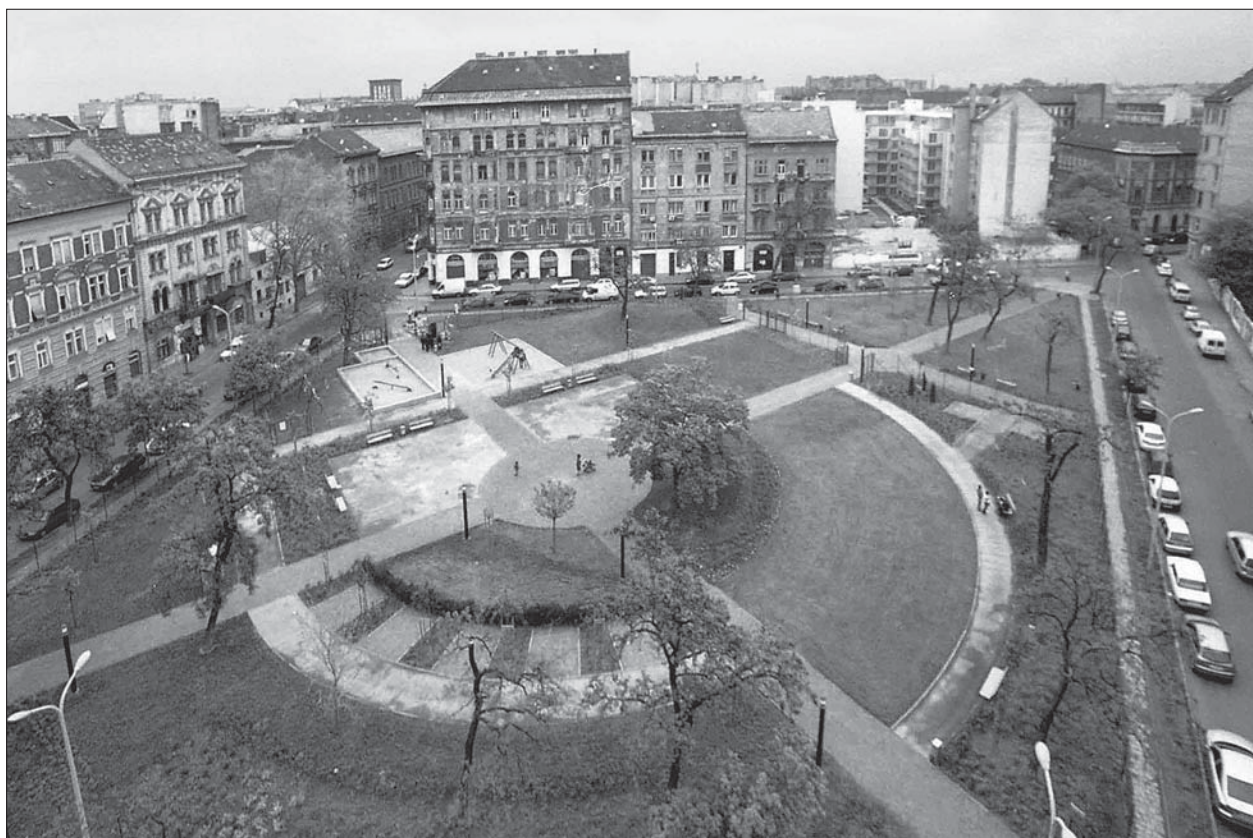
Figure 6: The renewed Mátyás square in 2008 (source: Rév8 Zrt., Nyári Gyula).

After summary of designation and validity of the strategy the document profoundly analyses and summarizes the environmental condition and challenges of Józsefváros, and points