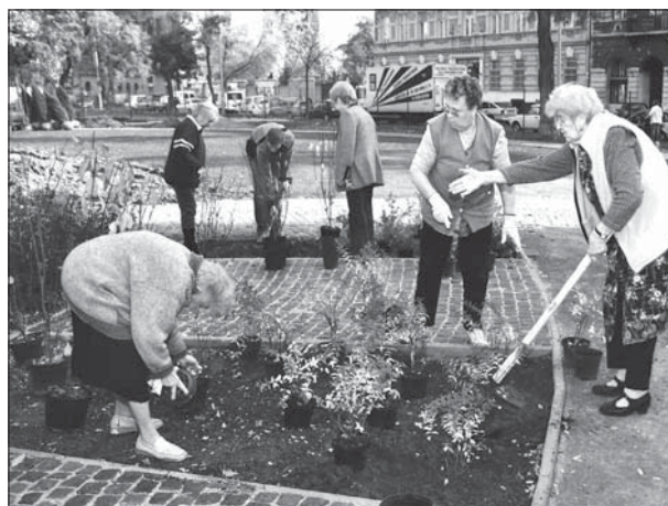
Figure 5: Public Planting in Mátyás square in 2007.

The implementation activity was divided into two parts. The first stage which was financed by the GreenKeys was commenced in December 2006 by creating so-called sitting-hills for the square as an alternative to benches. Pupils of one of the schools of Magdolna Quarter, local NGO’s and students