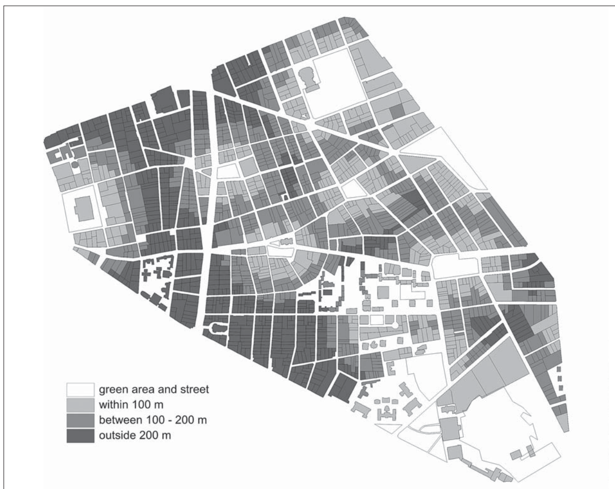
Figure 3: Green space availability in Inner- and Mid-Józsefváros.

of economically active population (40 %) is lower but that of the unemployed is somewhat higher (13 %) than in the entire Józsefváros. The most alarming problem of Magdolna Quarter is the extremely high ratio of people with low school qualification: nearly 40 % of the population aged 15 to 60 only completed 8 years of primary school.