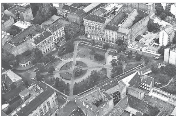
Figure 4: The view of run-down Mátyás square in 2005.

By the introduction of Magdolna Regeneration Programme and Greenkeys Project the goals and actions were revised in 2005. The main goal of the revised renewal activity was the creation of high quality and well-maintained urban green space with new public functions in the former run-down Mátyás square (Figure 4). The preparation and the implementation phases of the pilot project were accomplished from 2005 until March 2008 including the public discussions on demands and expectations of local residents (Table 2). The experience shows that the whole progress should be shorter than we used.