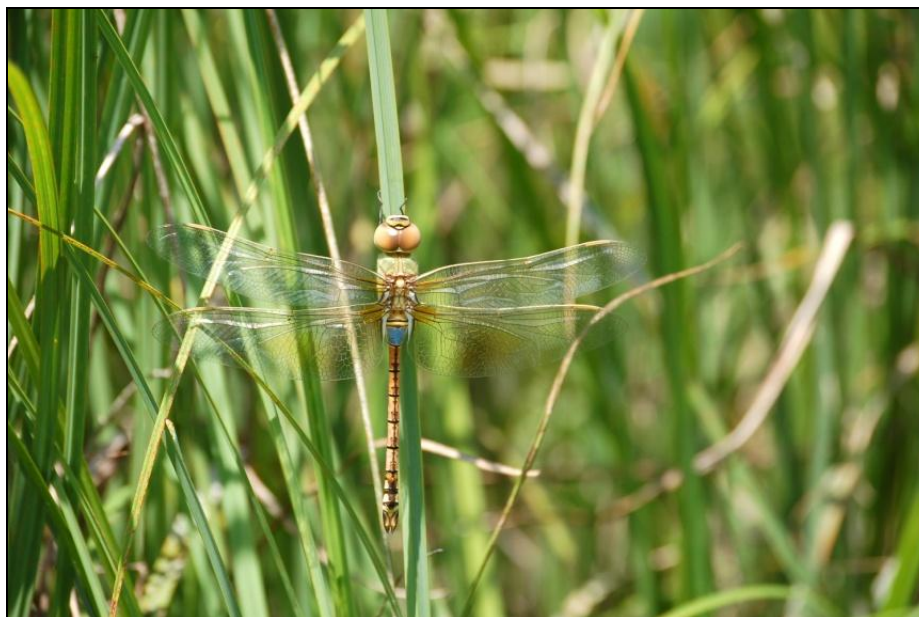
Figure 2. Sighting of fresh Anax ephippiger confirms successful reproduction of this species in Serbia.

Slika 2. Najdba svežih osebkov afriškega minljivca ( Anax ephippiger ) potrjuje uspešno razmnoževanje te vrste v Srbiji.