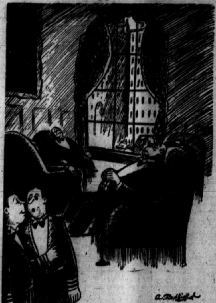
He's so worried about the Ohio relief crisis he won't eat.

venke v Ameriki (Progressive Slovene Women in America); Zapadna Slovanska Zveza (Western Slavonic Association); and the Jugoslavanska Socialistična Zveza (Jugoslav Socialist Federation).