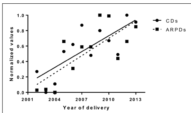
Figure 2. The linear trend of CD and ARPD delivery in three regions of Kosovo from 2002 to 2013.

To determine the effects of age, gender, residence and denture location on the likelihood of the type of the denture treatment among the patients, a binomial logistic regression model was conducted (Table 3). The model explained 14.7% (Nagelkerke R 2 ) of the variance in the type of denture predicted and correctly classified 73.9% cases.