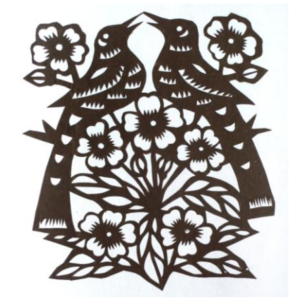
Fig. 20: "Double Xi in Hall"