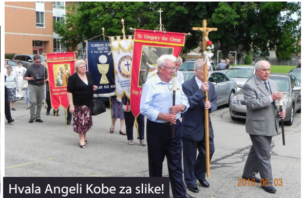
Hvala Angeli Kobe za slike!