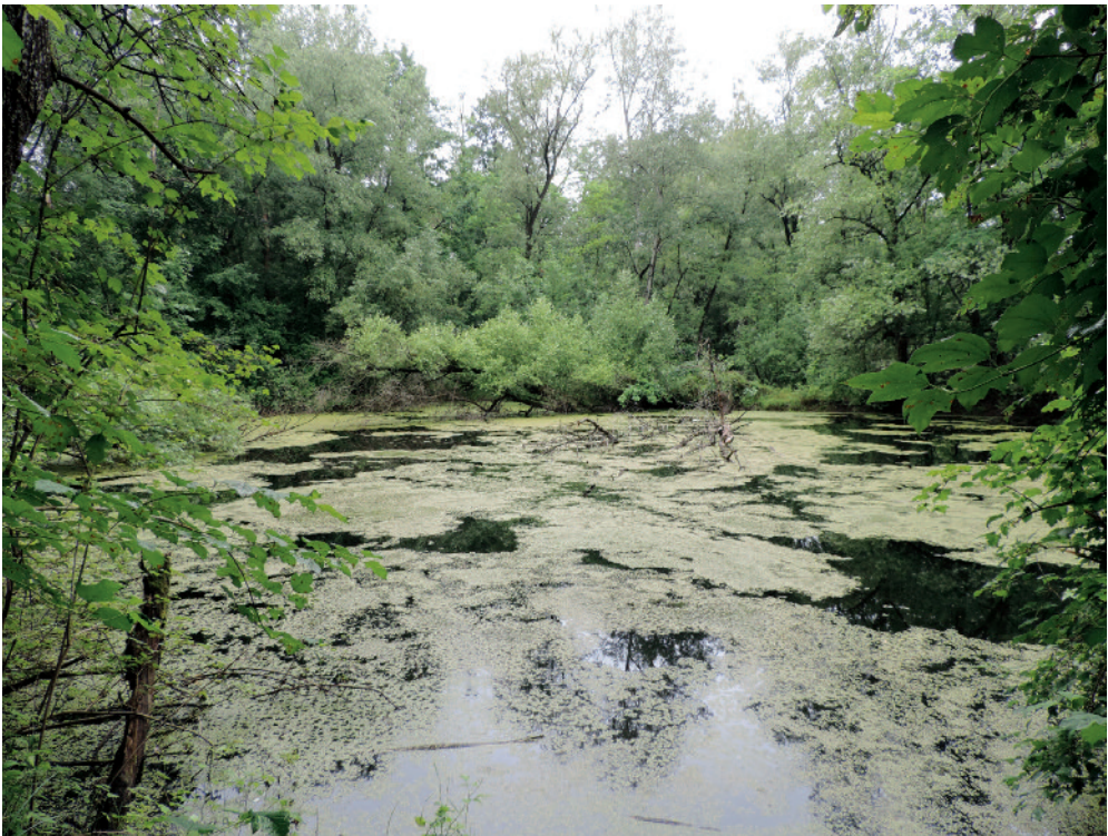
Figure 2: An abandoned gravel pit in the Siget gravel system, Spodnje Krapje by the river Mura, in which Graphoderus bilineatus was first rediscovered in Slovenia in 2011, but its occurrence was not confirmed after 2011.

Our findings indicate great rarity and vulnerability of the Graphoderus bilineatus population in Slovenia. The only known recent location for the species is in the Mura river basin, which is probably the last area where this species survived in Slovenia, since analysis showed that it had disappeared from the Drava river basin with 90% probability (Ratajc 2017). Main habitats for this species in Slovenia are oxbows, abandoned gravel pits and old riverbeds. It is difficult to speculate about specific habitat requirements of the species here, however, the two recent locations both have clear water and a substantial shallow water area with rich riparian vegetation. We have not detected any major changes to habitat quality at Spodnje Krapje (Figure 2) in terms of water chemistry or aquatic vegetation. Only certain anthropogenic disturbances were noticed (e.g. logging and an increase in non-native fish abundances) and the species had apparently disappeared from this location. Graphoderus bilineatus