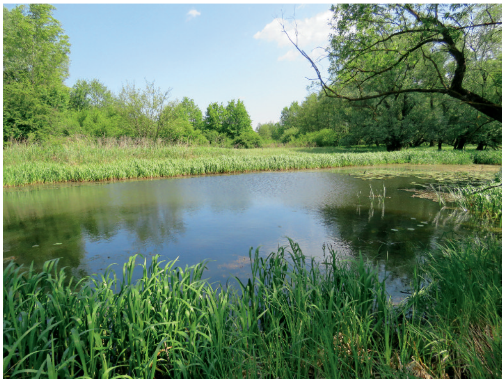
Figure 3: The second recent location for Graphoderus bilineatus is in the old riverbed of Ledava River in Murska šuma. The species was found here in the years 2017 and 2020 and probably represents the relict remnants of the population in Slovenia.

Slika 3: Stara struga reke Ledave v Murski šumi je druga recentna lokacija za ovratniškega plavača Graphoderus bilineatus . Vrsta je bila tu najdena v letih 2017 in 2020 in verjetno predstavlja reliktni ostanek populacije v Sloveniji.