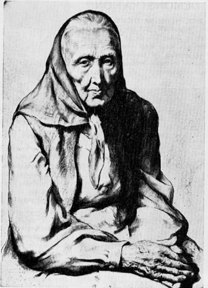
The care-worn face of an immigrant woman — like so many who have left a proud legacy to their succeeding generations.

filling eleven lunch pails, seven days a week. Then there was washing by hand, ironing, and cleaning for fourteen people. My two girls had to help before they went to school in the morning. When they came home in the afternoon, they put on work clothes and began to carry pails of water, from the hand pump which was located one block away and shared by all the neighbors. Every day the girls carried many, many pails of water for cooking, bathing, washing clothes, and drinking. It was a never ending job along with washing and drying breakfast and dinner dishes, helping with the laundry, and cleaning house. They complained because they didn't have