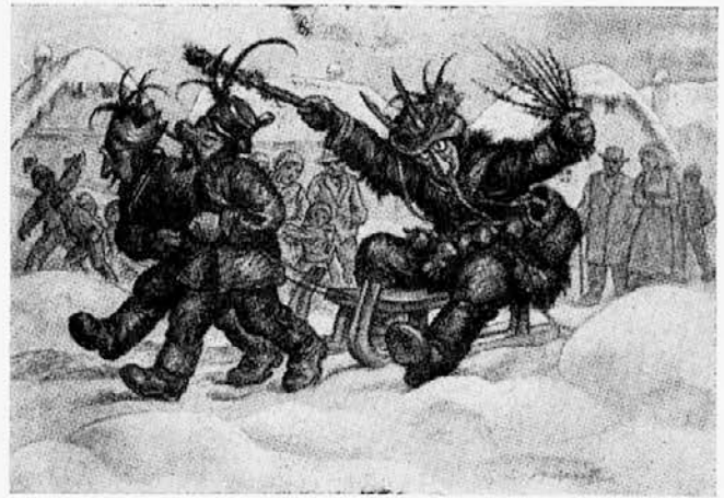
Pusta peljejo . . . M. Gaspari

Oče se je obotavljal privoliti. Skrita skrb je ždela za njegovimi besedami. Nazadnje je naravnost povedal: "Gospod doktor!" je rekel. "Kolikor vem, potrebujete bogato nevesto. Opozorim vas, da jaz Pavli, čeprav je edinka,