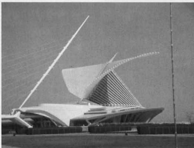
Milwaukee Art Museum

over 100 ethnicities represented. This is likely the only cosmopolitan city in the U.S. with this type of display, including Slovenia. The convention venue is within walking distance of several museums, including the marvelous architectural wonder of the Milwaukee Art Museum. On the roof of the museum the Burke Brise Soleil has a wingspan comparable to a Boeing 747-400. The two ultrasonic wind sensors automatically open and close the wings; if the wind speed reaches 23 mph the wings close, which keeps the Museum on the ground. For