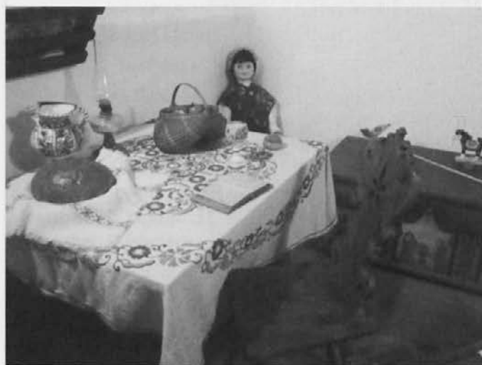
Slovenian house at European Village, Milwaukee Public Museum