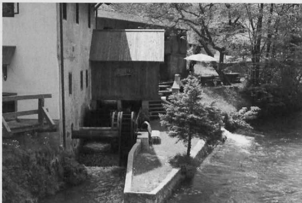
Old mill in Northern Slovenia with evidence of Roman military passing through on the inside walls

All over Slovenia before WWII, cattle rearing used to be one of the basic activities. Being a herdsman was a very common occupation. Although people nowadays imagine a smiling boy playing the flute while tending to cattle or sheep, it was not easy or carefree work. The shepherd was responsible for a herd and if a cow or sheep got lost or was eaten by a wolf, he had to work long enough to pay for the value of the lost animal. It was common for farmers to graze cattle and/or sheep on common village pastures.