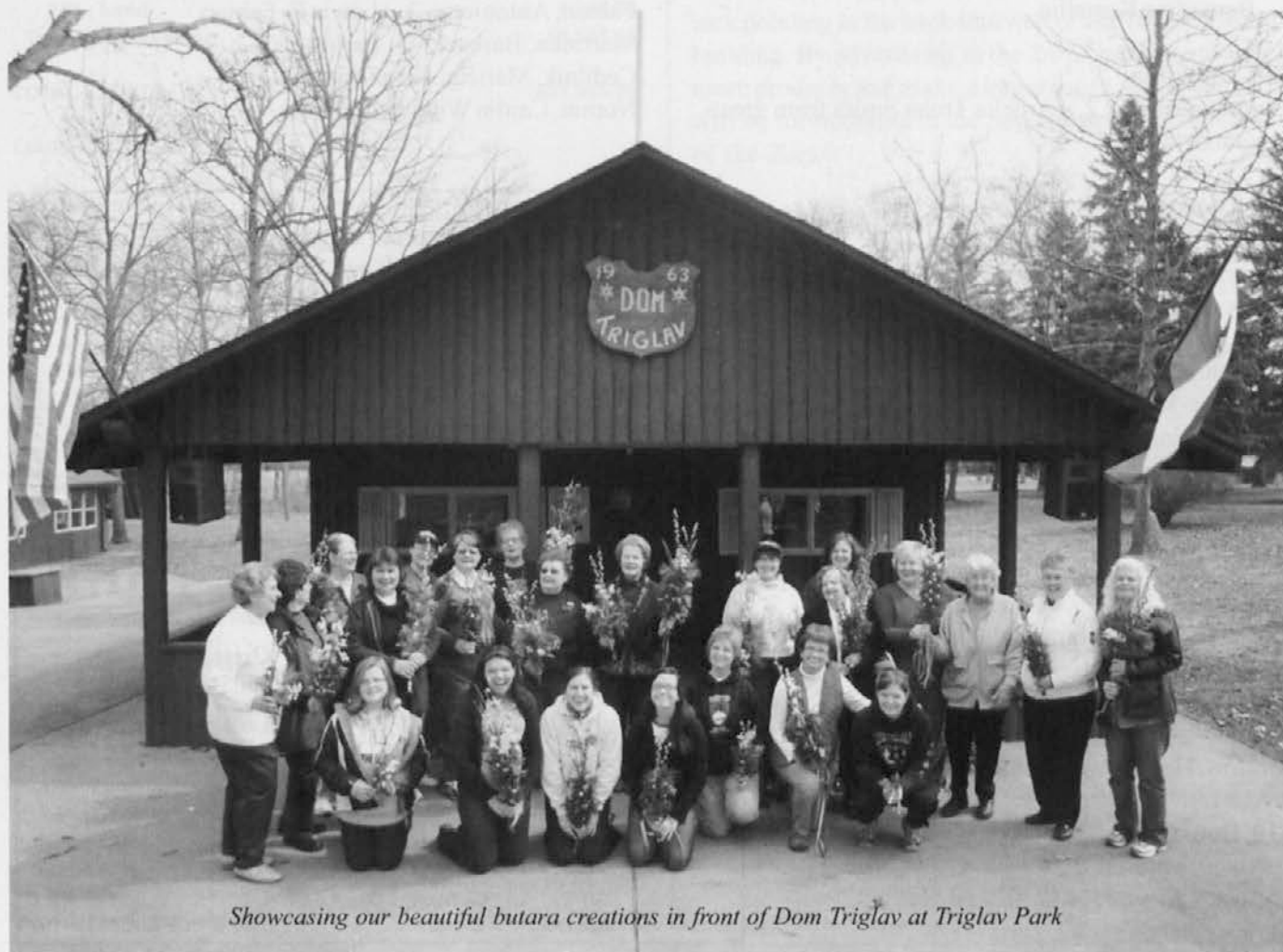
Showcasing our beautiful butara creations in front of Dom Triglav at Triglav Park