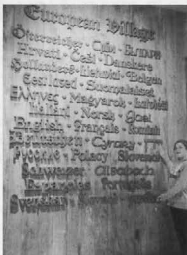
Slovenci are listed in European Village, Milwaukee Public Museum

woods, resembling Lake Bled in Slovenia is a quaint Our Lady of Brezje chapel. There is so much more to see and, something for everyone in and around Milwaukee to do, and kids of all ages will love Kopps's frozen custard, that is really cool after a day of city adventures or meetings. The best of all are the friendly members of Branch 43 that know the true