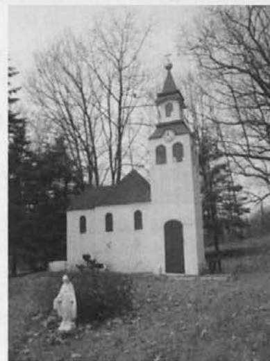
Our Lady of Brezje Chapel at Triglav Park

woods, resembling Lake Bled in Slovenia is a quaint Our Lady of Brezje chapel. There is so much more to see and, something for everyone in and around Milwaukee to do, and kids of all ages will love Kopps's frozen custard, that is really cool after a day of city adventures or meetings. The best of all are the friendly members of Branch 43 that know the true