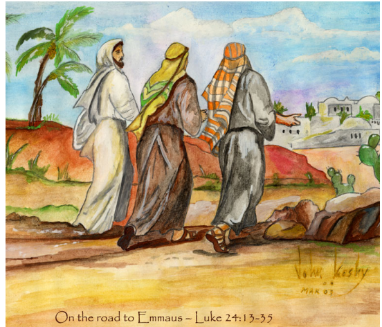
On the road to Emmaus – Luke 24:13-35