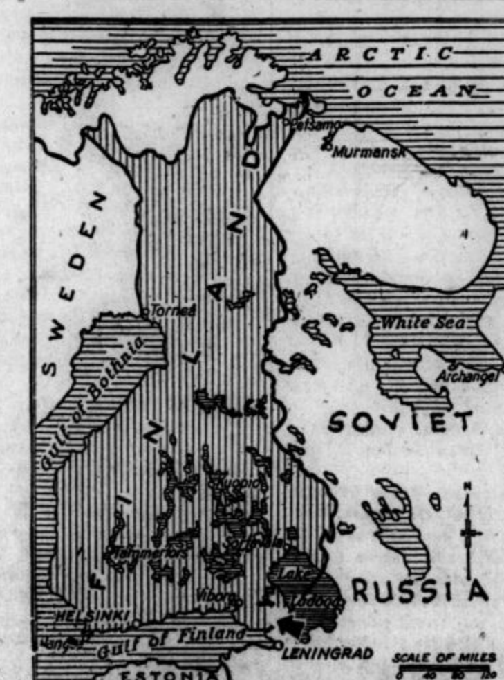
Na sliki vidite, kje so udrali Rusi na Finsko. Pri Leningradu je udrla pehota, letalci so bombardirali Helsinko in Viborg in prav gori na severu Petsamo.