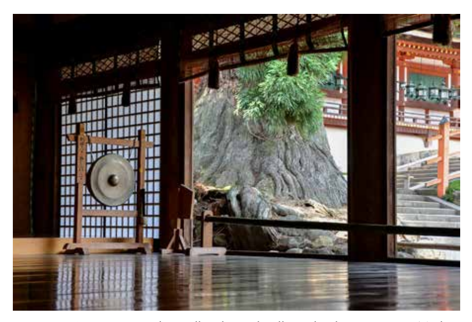
Figure 2: Gong in Naoraiden Hall and sacred millennial cedar tree, Kasuga Taisha Shinto Shrine, Nara, June 2014.

related to Shinto ceremonies which includes music is kagura , which serves as the generic name for all Shintō music and dances, with at least a thousand years of tradition. Broadly speaking, it is used in rites where purification followed by prayer offering takes place; and it appears in theatrical form tied to Japanese mythology.<sup>17</sup> We could literally translate it as "god music," or as Hughes puts it "performances entertaining native deities to grant prosperity and long life"<sup>18</sup>. Malm proposes that kagura can be divided into three: mikagura or formalized kagura , adopted during the Heian period, featured with little