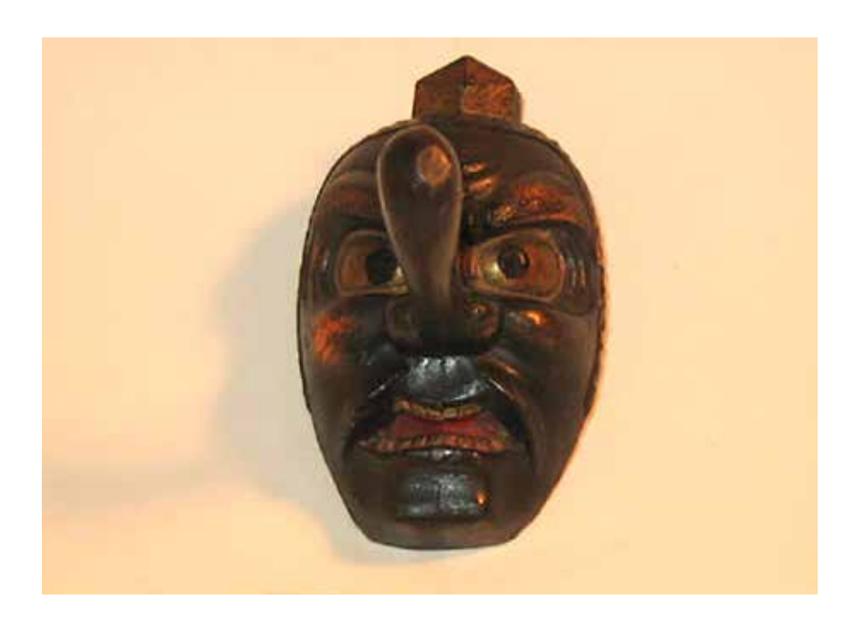
Figure 5: Small miniature of tengu mask (bronze, 6.6 x 4.1 cm), black and in some parts coloured in red and gold, with a small box tokin (兜巾) on the top of its forehead, representing a hat or a drinking cup, headwear associated with mountain monks yamabushi , whose form they often assume. It could be used as a wall hanging, as it is said that the hanging of Japanese traditional masks can bring happiness. (Collection of Alma Karlin (K24), Celje Regional Museum Archives).

Another object from Karlin's collection we could link to the Shinto religion is a small tengu (天狗, 天 stands for heaven and 狗 for dog, or heavenly dog) mask, which is in Shinto considered as kami or yōkai (supernatural being), a bird-like mystical creature, which can take part in kagura performances, and is often used for a theme in a comic monologue called a rakugo. Its significant features, a long nose protruding from a red painted face, were inspired by the Japanese mythological figure Saruta Hikonomikoto (猿田彦命).