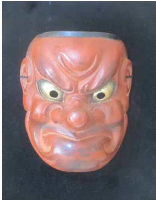
Figures 6 and 7: Actual size of tengu\ n\bar{o} mask, made by the mask carver Hideta Kitazawa (Source: Hideta Kitazawa).