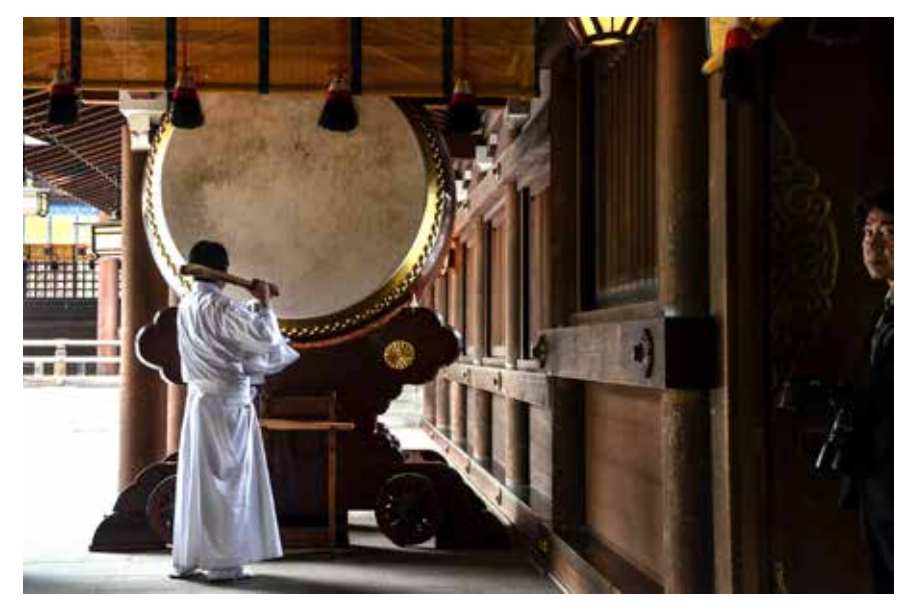
Figure 1: Calling the gods with the taiko drum, Meiji Shinto Shrine, Yoyogi Park, Tokyo, June 2014.

Shinto (or "the way to the gods/deities"), as a Japanese indigenous religion, with its practices first recorded in the written records Kojiki ("Records of Ancient Matters") and Nihon Shoki ("The Chronicles of Japan") in the 8th century, focuses on ritual practices related to the worship of various gods (kami), crucial in harvest, spring, and other festivals. It is not an organized religion, is without a founder, priest (only a ritualist), as well without sacred scriptures; but each Shinto shrine has its collections of prayers. The primary concern of its practices has remained the same; taking care of or purification of a certain place or thing, which can be done by any individual or a priest. As a symbol of purification, "pieces of bamboo, spring of sasaki, or rice-straw rope to which paper and flax pendants are attached" are prepared and hanged at the purified places. The most common form