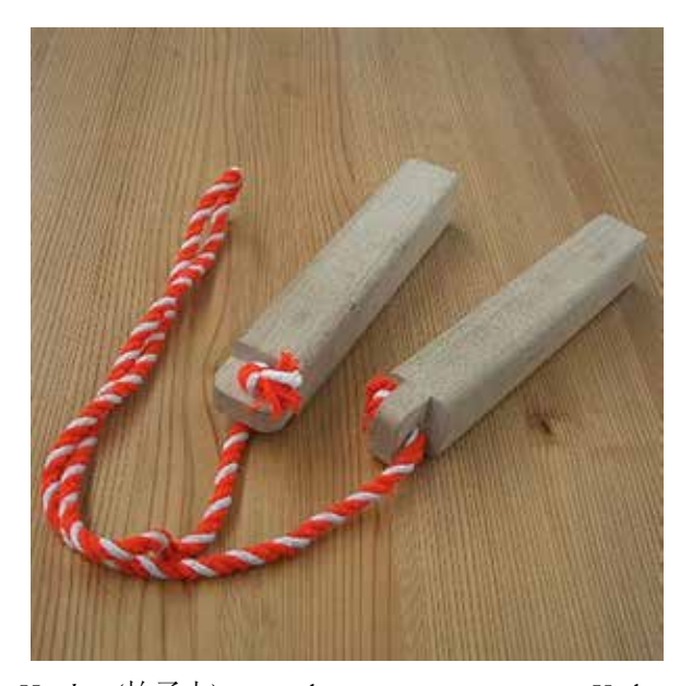
Figure 10: Hyōshigi (拍子木), a simple percussion instrument Karlin paid special attention to when visiting the theatre. It is very distinctive in kabuki, seen often as well in Shinto festivals, and used in some forms of Buddhist practice, as well as in the new Japanese religion Tenrikyō.

The most interesting part, where she wrote of music a little bit more, is surely on Japanese theatre and dance performances in "In the fishing villages":<sup>57</sup>