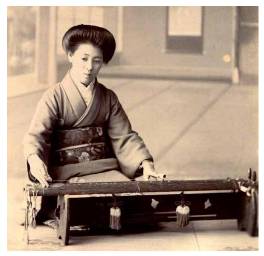
Figure 4: Yakumo-koto as played, using a low table and cylindrical picks ("Geisha playing on a yakumogoto" by Okinawa Soba (Rob) is licensed under CC BY-NC-SA 2.0).

above mentioned myth.<sup>37</sup> The members of the sect and their spiritual leader believe that performing the arts is a religious practice, and they engage in such traditional arts as the tea ceremony, weaving, ceramics, n\bar{o} , poetry, and martial arts. One of their main stances was in opposition to militarism from the start. Just before Alma Karlin came to