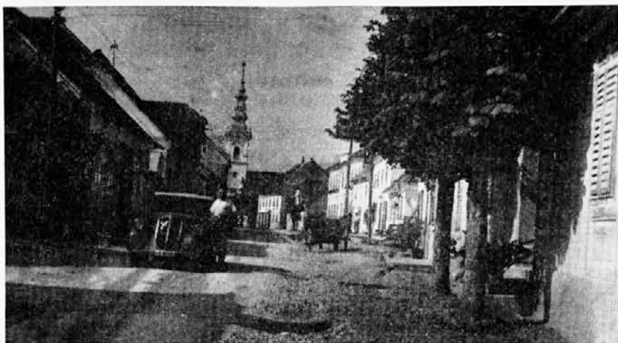
BRASLOVČE V SLOVENIJI

Sherman Oaks, California. — Naj tudi jaz nekoliko opišem moje potovanje v stari kraj lansko leto, kamor sva s hčerko potovali potom nemške zračne linije. V Monakovem naju je že čakal nov avto, katerega sva kupili pred odhodom iz Amerike.