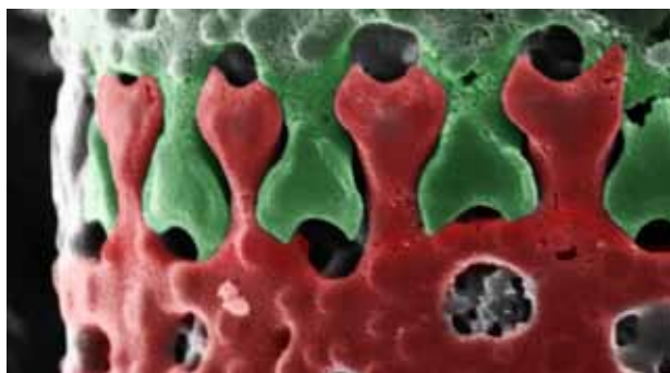
Figure 3: A detail of the cell joint structure - linking valve of alga Aulacoseira ambigua f. japonica Tuji & D.M. Williams from Slivniško Lake (Slovenia), scanning electron microscopy. Scale bar as on Figure 2E.

Slika 3: Detajl povezovalne strukture dveh lupinic alge Aulacoseira ambigua f. japonica Tuji & D.M. Williams iz Slivniškega jezera (Slovenija), posnetek vrstičnega elektronskega mikroskopa. Merilce kot na sliki 2E.