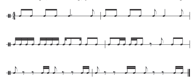
Appendix 4: Vitaminski rap (Vitamin rap) from the book Glazbena osmica, p. 9

lemon, papaya, banana and so on). The example is easy to repeat if it is done by ear. After the score is displayed pupils can see the complexity of the rhythmical patterns. Creation of new piece can then be based on different words and topics (flowers, animals, towns, states) and it can be articulated by voice or played on some instrument, without score.