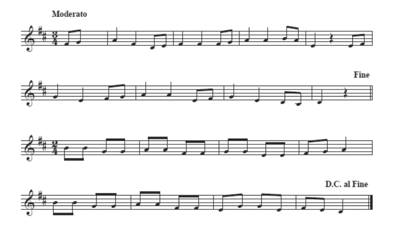
Appendix 15: Similar characteristics