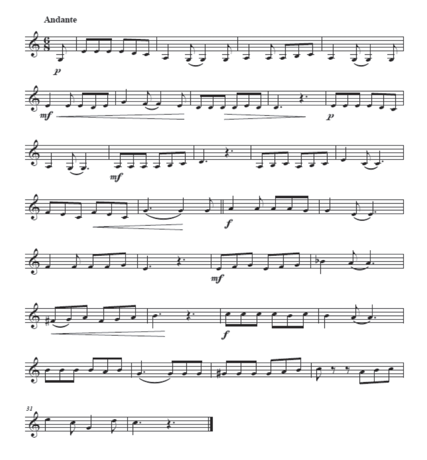
Appendix 8: Mala kuća (Little house) - from the book Glazbeno stvaralaštvo (Vidulin - Orbanić), pp. 100–101.