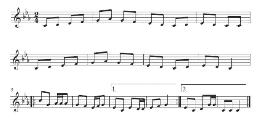
Appendix 6: Zima (Winter); from the book Glazbeno stvaralaštvo (Vidulin - Orbanić), p. 103