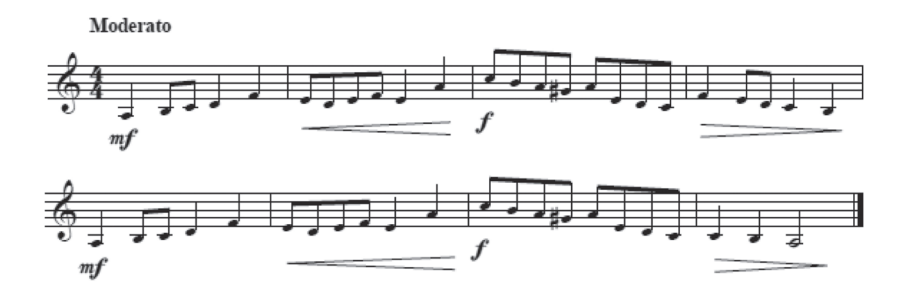
Appendix 7: Metamorfoza (Metamorphosis) - from the book Glazbeno stvaralaštvo (Vidulin - Orbanić), p. 88

The song Little house ( Mala kuća ) has a focus on the melody line, which is going forward. The melodical advancement is visible through the ternary form ABC. When it is sung, it passes from the solo part to duet and trio. The song is rhythmically simple. The melody range is from g to e2.