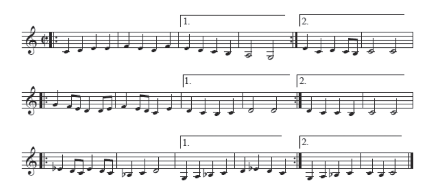
Appendix 5: Bransle de chevaux

Dealing with this work, changing the parameters and exploring the musical elements, the pupils can create similar or different musical structures using the known musical elements.