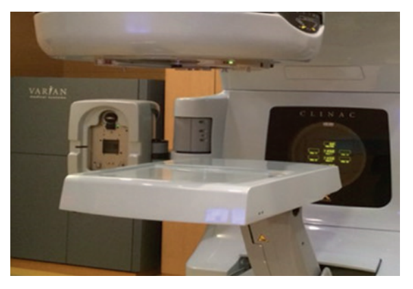
FIGURE 1. Pictures of the experimental setup for IMRT QA using various dosimetric tools. (A) Film, (B) Mapcheck, (C) ion chamber array (MatriXX), (D) Portal dosimetry.