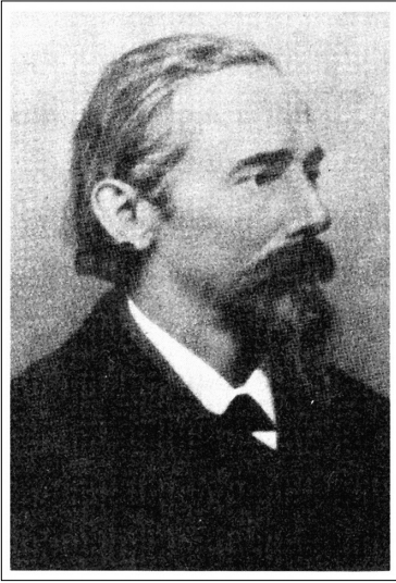
Figure 1: Theodor Gartner, 1843–1925.

The area affected by these events was rather heterogeneous, characterized by different varieties of language and distributed over different political entities. The central area was mainly included in the province of Tyrol belonging to Austria-Hungary (a historically multilingual territory) and had its cultural heartland in some valleys situated between the Dolomites at the borders with the Veneto region (belonging to the Kingdom of Italy since 1866), whereas the surrounding areas represented – according to experts – a sort of transitional zone towards the dialects of northern Italy; this area included the valleys of Nonsberg (Anaunia) and Sulzberg in western Trentino. Outside the borders of the empire, there was the western part of the Ladin area, formed by some Romansch-speaking valleys of the Grison Canton (in the Swiss Confederation), while to the east the broad Ladin-speaking area of Friuli was mainly included in the Kingdom of Italy in 1866; only