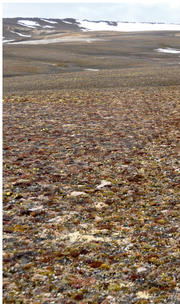
Figure 3: Tundra-like polar desert cushion forb-lichen-moss vegetation near Krenkel Station at 80°38' N on Hayes Island, Franz Josef Land, Russian Federation. Photo: D.A. (Skip) Walker, August 2010.

Slika 2: Splošni izgled vegetacije razreda Drabo-Papaveretea z vrstami Micranthes foliolosa , Papaver dablianum (rumene pike), Saxifraga oppositifolia , S. cespitosa , mahovi in lišaji. Isachsen, otok Ellef Ringnes Island, Nunavut, Kanada na permafrostu z značilnostmi strukturiranih talnih oblik (nerazvrščeni krogi) na rahlo nagnjeni podlagi. Foto: F.J.A. Daniëls, julij 2005.