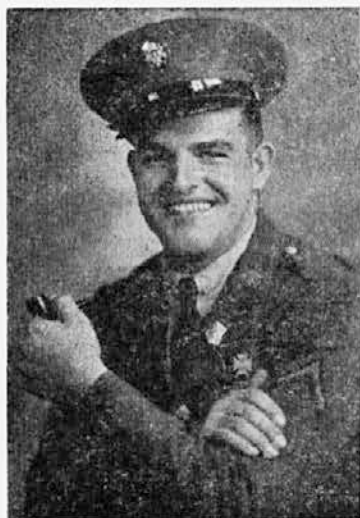
who died in the defense of his country, in 1942

"Many years have past since you left us. We miss you more as the years pass but your smile will never be forgotten."