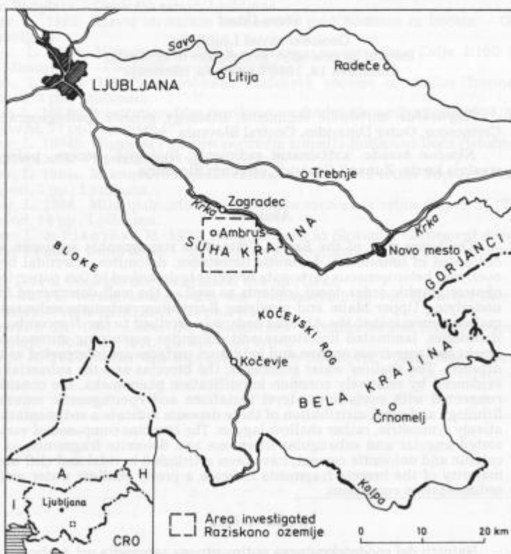
Fig. 1. Location sketch map of investigated area

The purpose of this preliminary work is to describe the carbonate formation, denominated the Ambrus beds that builds up the small hills Kamni vrh, Stražarjev vrh and Mali vrh at Ambrus. The most part of the data from the study area were obtained by detailed geological mapping for the Geological map of Slovenia on the scale of 1:50.000. This study is based on field mapping data and thin-section analysis. Facies characteristics of the Ambrus sedimentation have been considered, with the