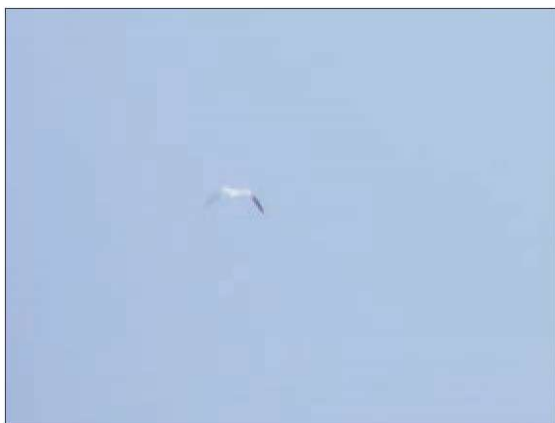
Figure 1: One of the Gannets Morus bassanus observed on 30 Jul 2008, 12 km north of town of Varna (NE Bulgaria).

Slika 1: Eden izmed strmoglavcev Morus bassanus , opaženih 30.7.2008 12 km severno od mesta Varna (SV Bolgarija).