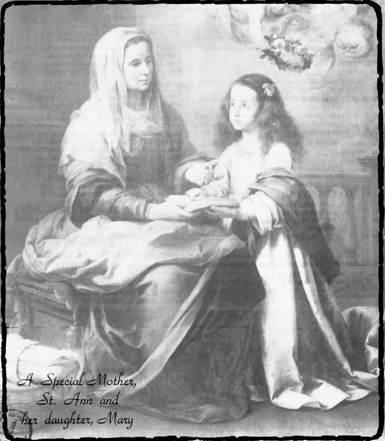
A Special Mother, St. Ann and her daughter, Mary