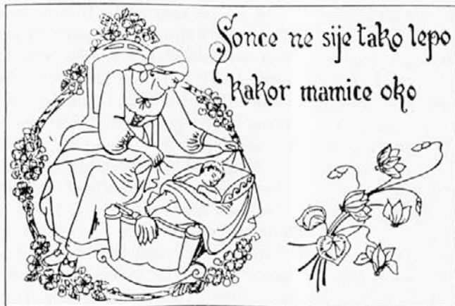
The sun does not shine as bright as the light in a mother's eye.