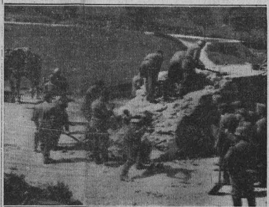
Na sliki vidimo zid, katerega so postavili Belgijci preko ceste, da bi zaustavili prodiranje nemških tankov. Nemci so se spravili ročno s krampji nad zapreko ter jo podrli.