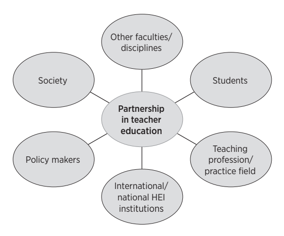
Figure 1. Partnerships in teacher education

Higher education institutions are commonly perceived to be the primary agent for preparing teachers and thus have the overall responsibility. This is, however, changing, and teacher education institutions are expected to establish partnerships with other stakeholders, as suggested in EU documents, such as Supporting Teacher Educators (2013) and Strengthening Teaching in Europe (2015). Both documents convey a clear call for cooperation. Furlong et al. (2000) and Darling-Hammond (2006) argue that teacher education needs to form strong relations with agents inside and outside academia, and especially on the practice field. It is argued in this paper that teacher education might be strengthened if teacher education institutions form partnerships with a number of stakeholders, as illustrated in Figure 1.