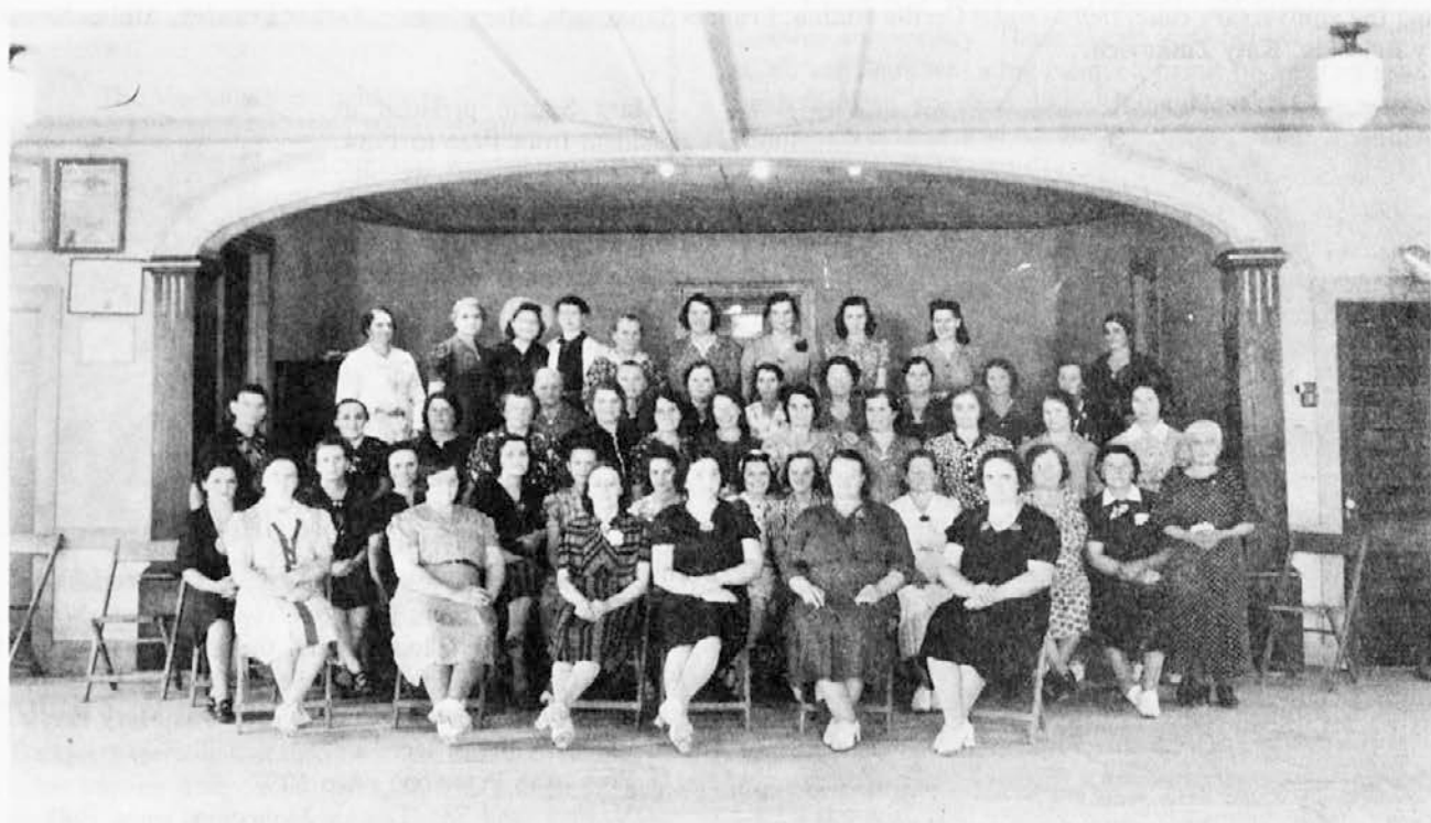
This photo was taken in 1939, three years after the branch was founded. It appears that this is a photo of the members of Branch 67 with the officers seated in the first row.

organizer of Branch 67 in Bessemer and 74 in Ambridge, PA was an energetic worker for Zveza, served as an officer of her home Branch 53 in Warren, Ohio and was a member of the National Board in 1936 and again in the 1950's. She earned the title of "Convention Princess" at the 1936 National Convention in Milwaukee by enrolling 122 new members in the course of one membership campaign!