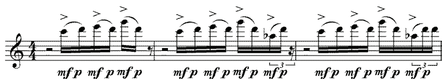
Example 3: Additively Built Melodic Line (Bars 171–173).

element – it begins with separate melodic fragments, which unfold into a recitative-like flute solo melody, designed with additive technique, centred around central tone d (example 3). Apart from the same title, there is another connection between Ligeti's and Vulc's pieces. In this last section of Lux aeterna by Tadeja Vulc tone-centred harmony is occasionally replaced with very obvious micro-canon, György Ligeti's invention.